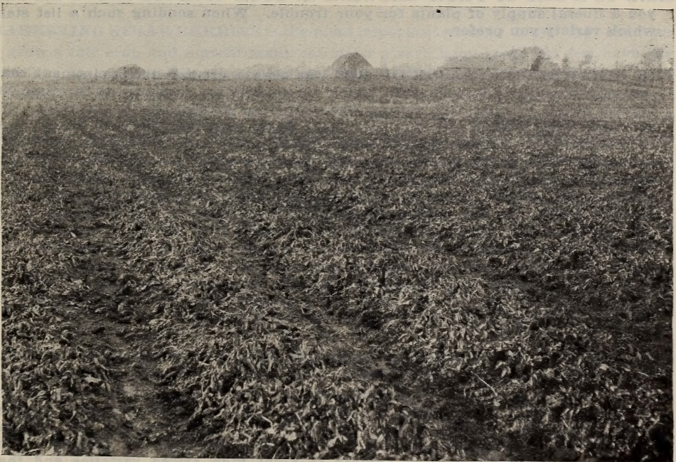
CORNER OF ANOTHER FIELD OF OUR SUPERIOR STRAWBERRY PLANTS. NO BETTER PLANTS TO BE HAD ANYWHERE.

WE WILL NOT FILL ORDERS AT CATALOG RATES DURING JULY, AUGUST AND SEPTEMBER —We cannot afford to dig plants except at special prices during these months.