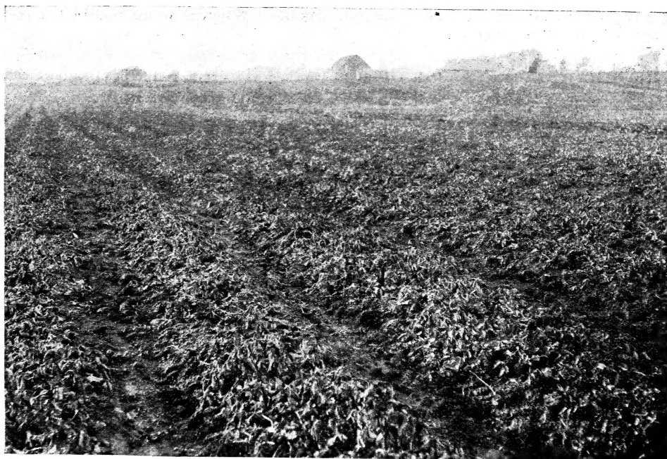
CORNER OF ANOTHER FIELD OF OUR SUPERIOR STRAWBERRY PLANTS. NO BETTER PLANTS TO BE HAD ANYWHERE.

WE WILL NOT FILL ORDERS AT CATALOG RATES DURING JULY, AUGUST AND SEPTEMBER —We cannot afford to dig plants except at special prices dur-