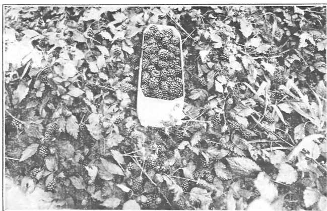
A Vine of Haupt Berry—the Same Every Year.

If you plant Haupt in rows 6 feet apart and 4 feet in the row, you will need 1815 on an acre. It may pay to put them 7 by 5 feet, using 1244 on an acre.