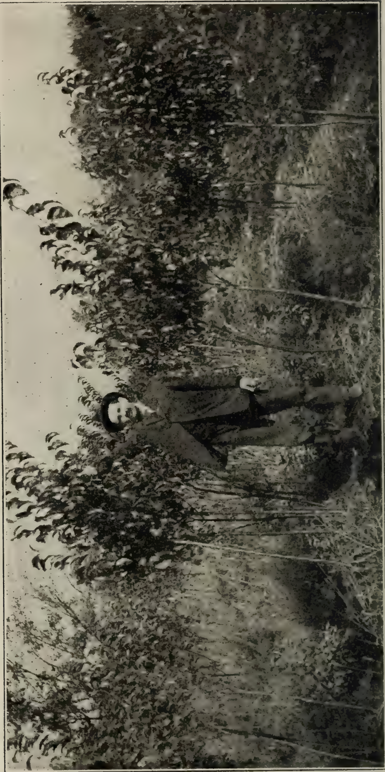
View of three year Plum Trees. Note size.