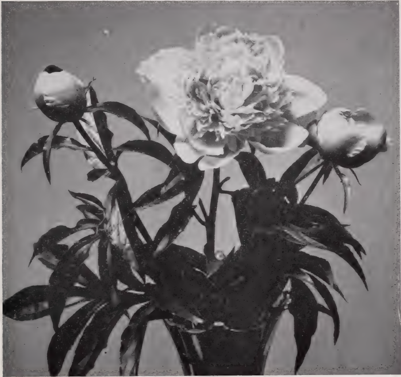
Dr. Bretonneau