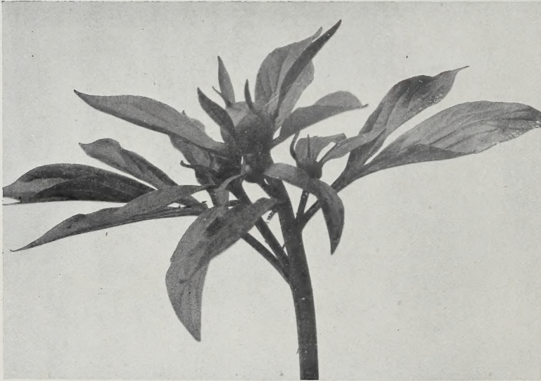
A Peony growth just after buds are formed

Most Peonies usually set three or more buds to a stem. (See cut.) All but the central (largest) bud should be pinched off as soon as they can be gotten hold of, if the finest individual blooms are wanted.