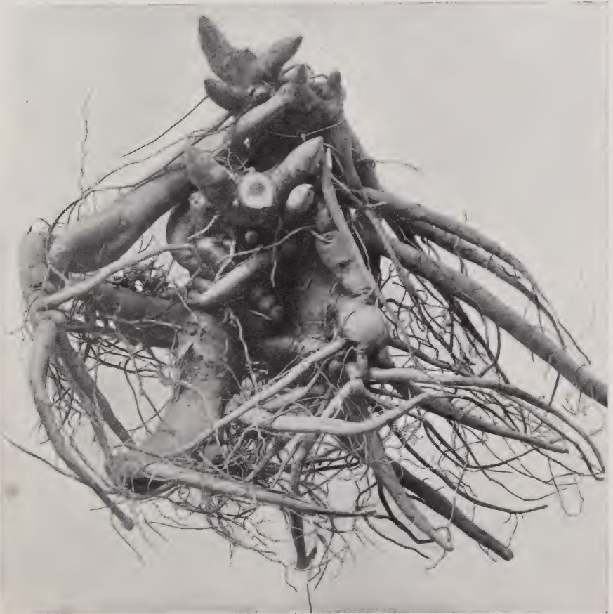
A Dormant Peony Root

The root should be set so that the upper eyes are about three inches beneath the surface of the soil, and, if planted in permanent beds, should be about 2\frac{1}{2} to 3\frac{1}{2} feet apart, according to room at one's disposal. When planted in field for cut-flower purposes, the plants should be set three feet apart in row, and rows from 4 to 5 feet apart.