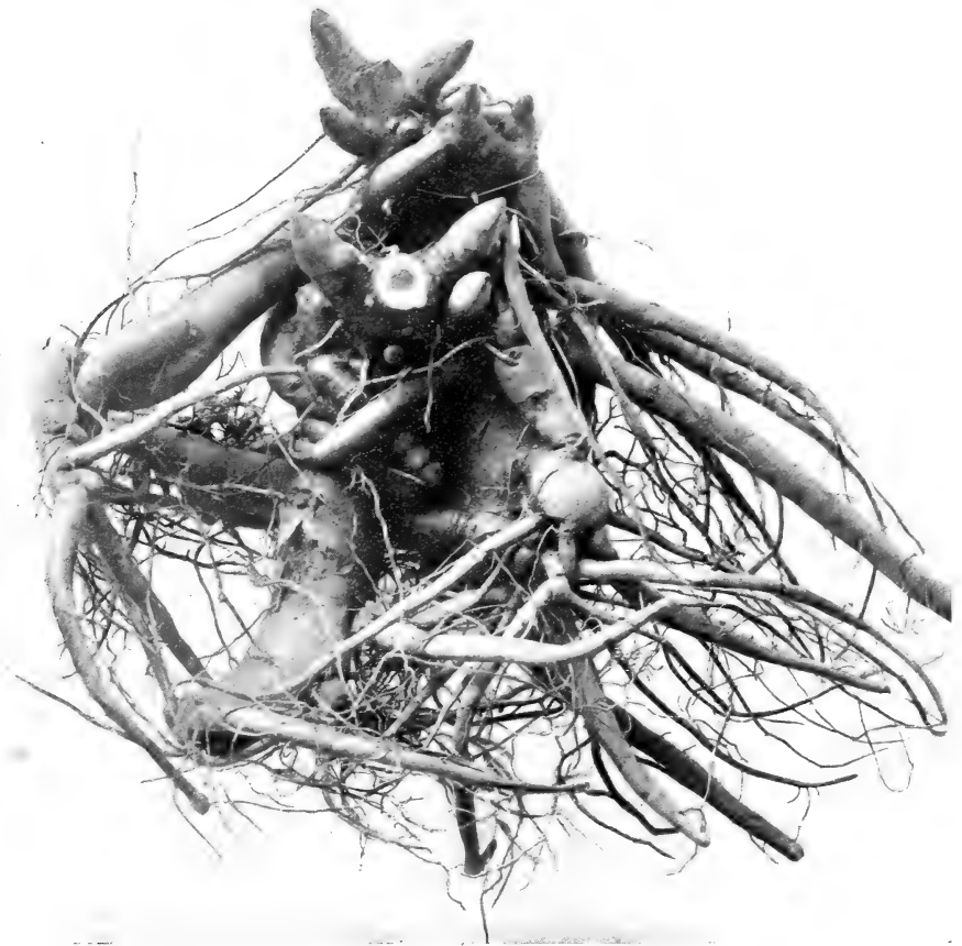
A Dormant Peony Root

The root should be set so that the upper eyes are about three inches beneath the surface of the soil, and, if planted in permanent beds, should be about 2\frac{1}{2} to 3\frac{1}{2} feet apart, according to room at one's disposal. When planted in field for cut-flower purposes, the plants should be set three feet apart in row, and rows from 4 to 5 feet apart.