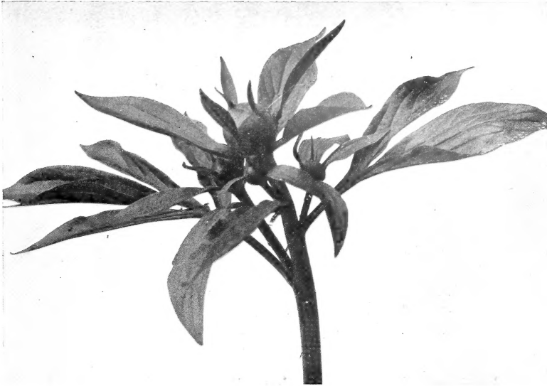
A Peony growth just after buds are formed

Most Peonies usually set three or more buds to a stem. (See cut.) All but the central (largest) bud should be pinched off as soon as they can be gotten hold of, if the finest individual blooms are wanted.