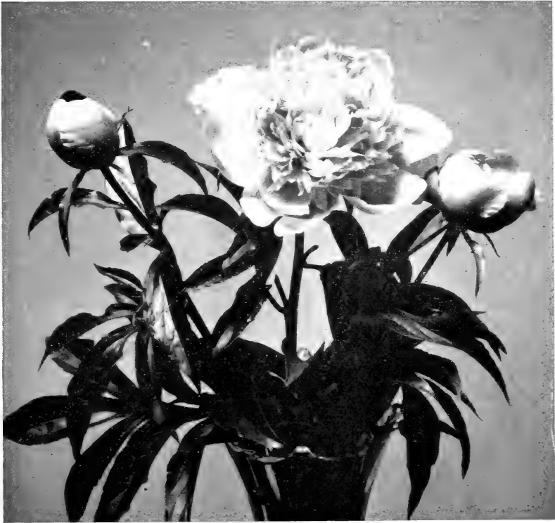
Dr. Bretonneau