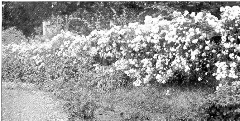
LADY GAY, AN IMPROVED DOROTHY PERKINS

We take pleasure in offering a select list of Roses, heavy plants, which will easily pay for themselves in bloom the first year. Why not have the best, since a good plant requires no more space or care than a poor one (except to pick the extra blooms)? A Rose garden cannot be made of weeds. Of thousands of varieties, not more than one hundred are worth growing in any given locality, unless one has a very large Rose garden. Some varieties do well in one section, some in another.