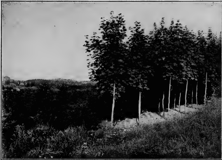
Straight Norway Maples in Wide Rows.