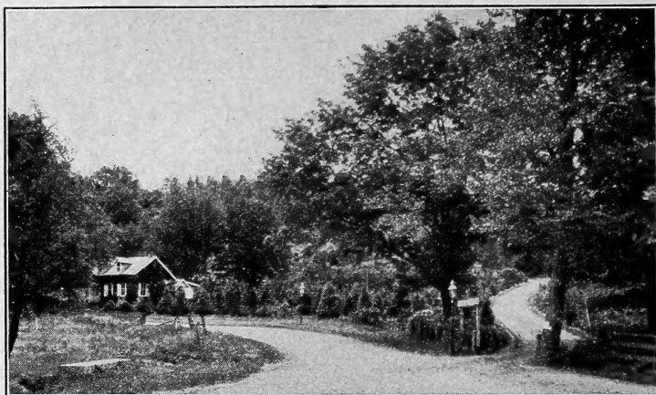
Nursery Entrance and Office.