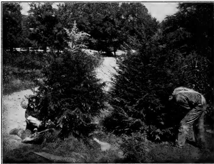
Showing fibrous roots of Hemlock.