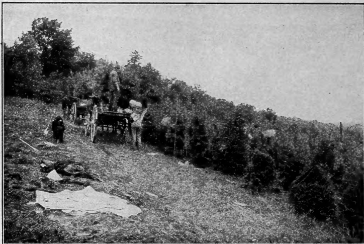
Loading White Pines