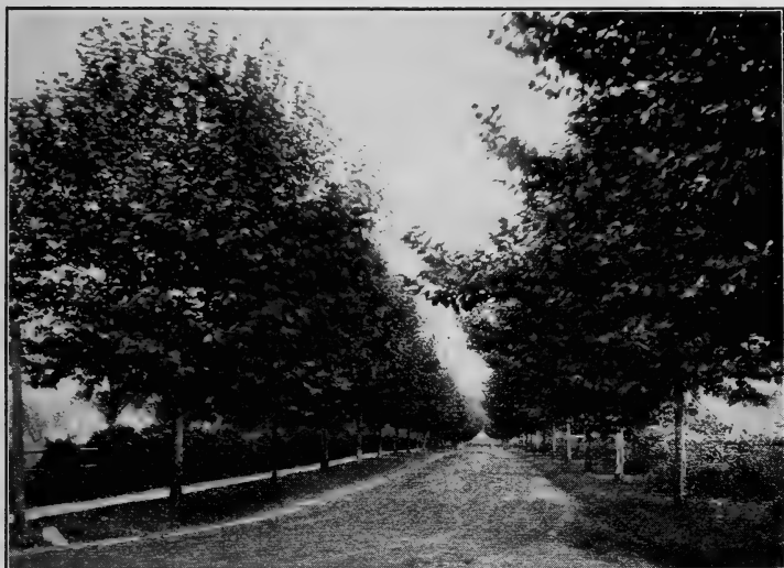
An Avenue of "Andorra-grown" Oriental Planes. (See page 30).