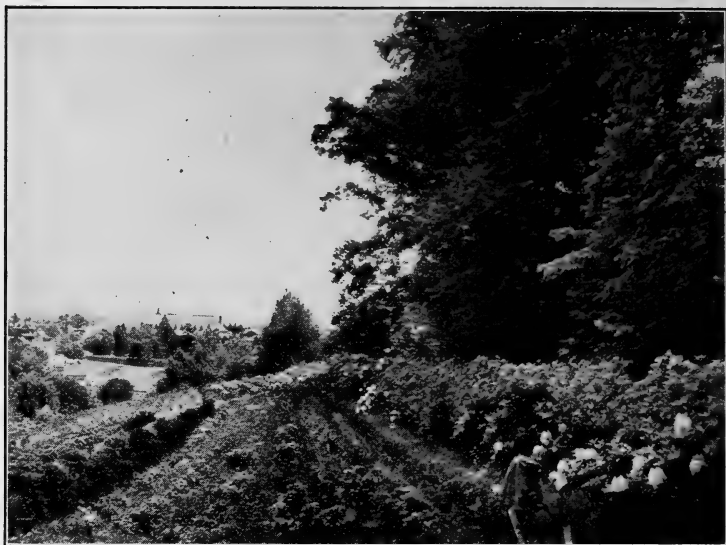
Rhododendrons at Andorra.