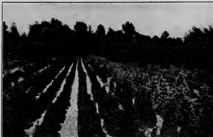
A Block of Box Bush and Evergreens.