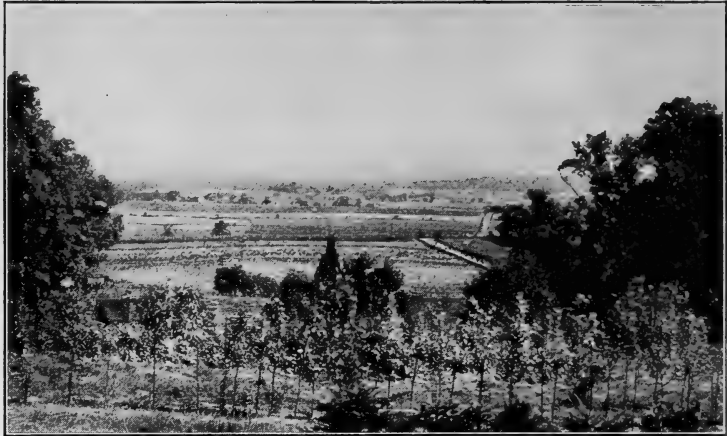
Partial View of Nursery Grounds from Top of Main Nursery.