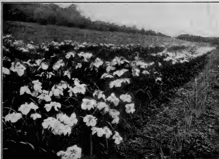
A field of Japanese Iris at Andorra