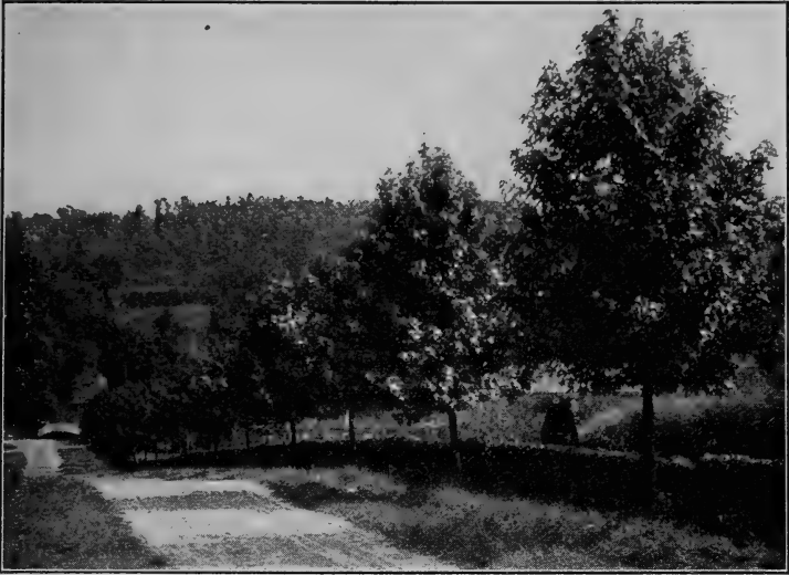
An Avenue of Sweet Gums (Liquidambar), at Andorra.