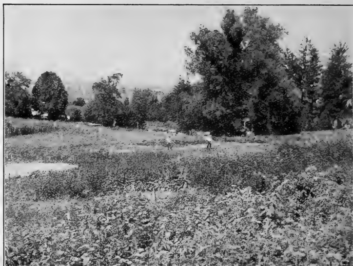
Partial view of Herbaceous Plantations