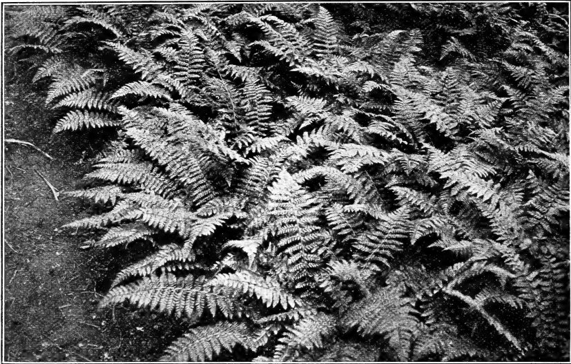
Aspidium aculatum , var. Braunii , as it grows under our fern bower.