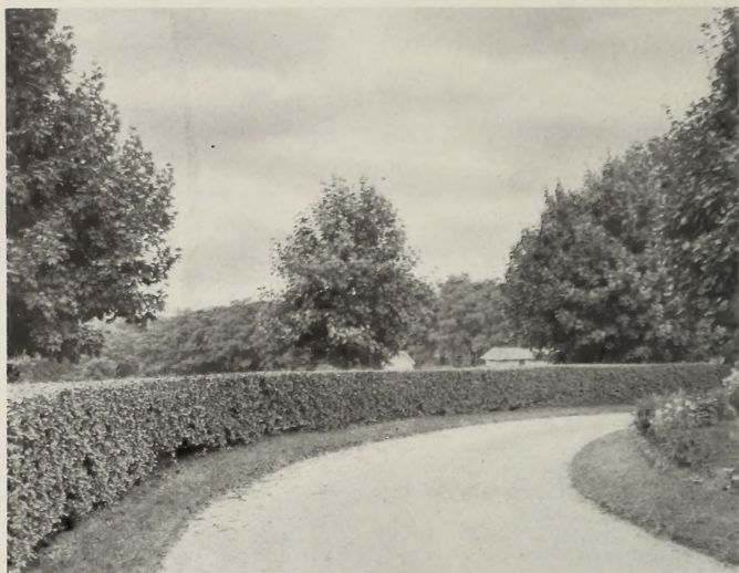
Amoor River Privet hedge with Norway Maple trees.