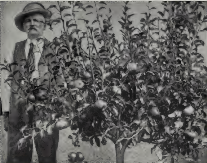
A Stark King David tree, three years old from planting, bearing its second crop.