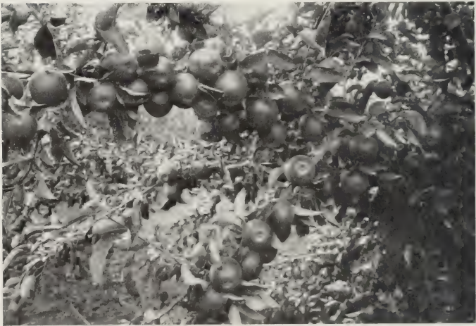
One branch of a seven-year-old Stayman Winesap—a new kind of gold-mine.