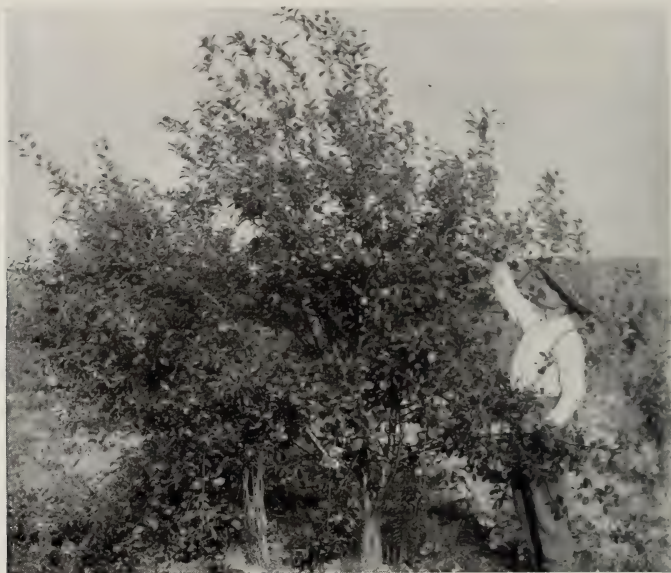
A four-year-old tree of Champion bearing a money-making crop.

liberally in the far West for Alaskan and Oriental shipments; its splendid keeping qualities make it the ideal apple for this trade.