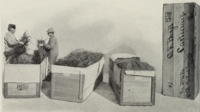
The Stark method of packing.

Rather too low branching for street, but one of the most desirable of all shade-trees for park or garden; a hard-wooded tree, moderately slow in growth, but well worth the extra time; deep green, dense, shining foliage, makes a very large and very handsome tree.