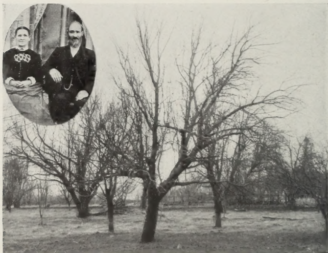
The originator and original tree of Stark Delicious. This tree, though twenty-seven years old, has borne twenty successive crops without one failure and has withstood 40 degrees below zero.

We cannot say too much for Delicious—in fact, we cannot command words to express one-half its excellence. We are growing them by the million and will sell every one we grow. When a fruit-grower sees Delicious, notes its delightful, fragrant aroma, and tastes its ideal, delicious flavor, he wants the tree in his orchard.