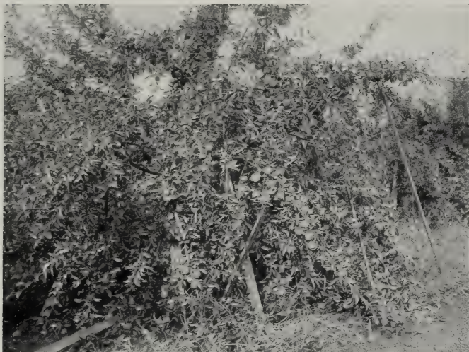
A seven-year-old Delicious tree in the Bailey Orchard, Chelan Co., Wash. One hundred of these trees earned $2000 for their owner this year.