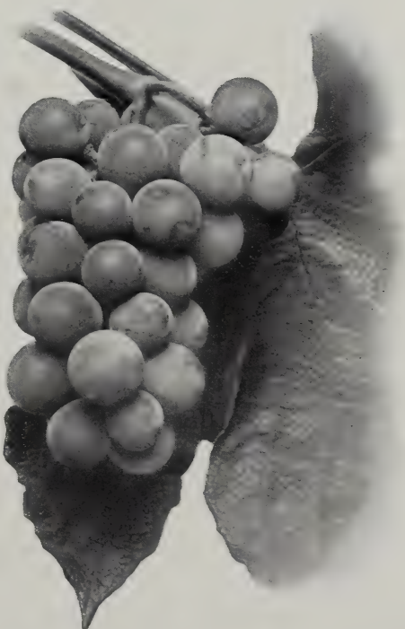
A bunch of Eclipse

I consider Eclipse far ahead of all early grapes; bunch and berries much like Concord, but of much better flavor. It is earlier than