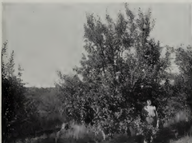
The original tree of Stark King David.

This variety should be planted in every case where an apple of the Ben Davis family is wanted. It will grow to perfection in any soil and in any climate that will produce the old Ben Davis, and is superior in every way; larger, solid dark red in color, and better quality. We do not claim for Black Ben the high quality of Delicious, King David, Stayman Winesap, Senator, etc., but we do claim, and the fruiting of the variety has proven, that it is the very best of the Ben Davis family. It is now fruiting everywhere; one of the most magnificent of apples; so beautiful that it will always sell at a high price on the markets. Ben Davis, Gano, and Missouri Pippin are being discarded. We advise orchardists who have planted these sorts to top-graft over to such varieties as Delicious, King David, and others which command higher prices.