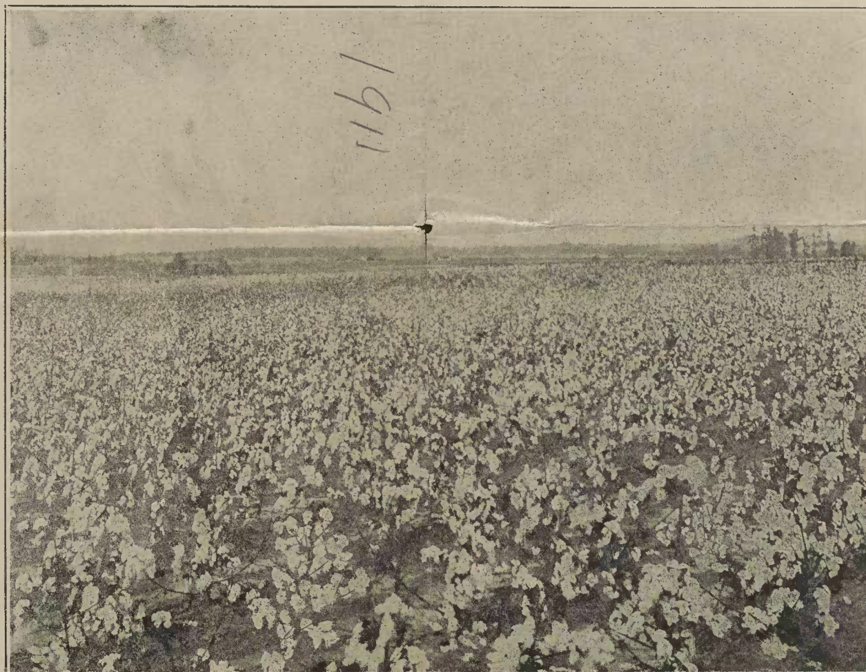
Field View, 2 Bales Open Cotton per Acre