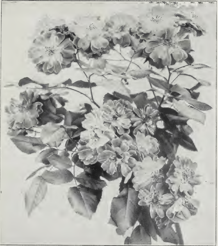
THE VIOLET BLUE ROSE