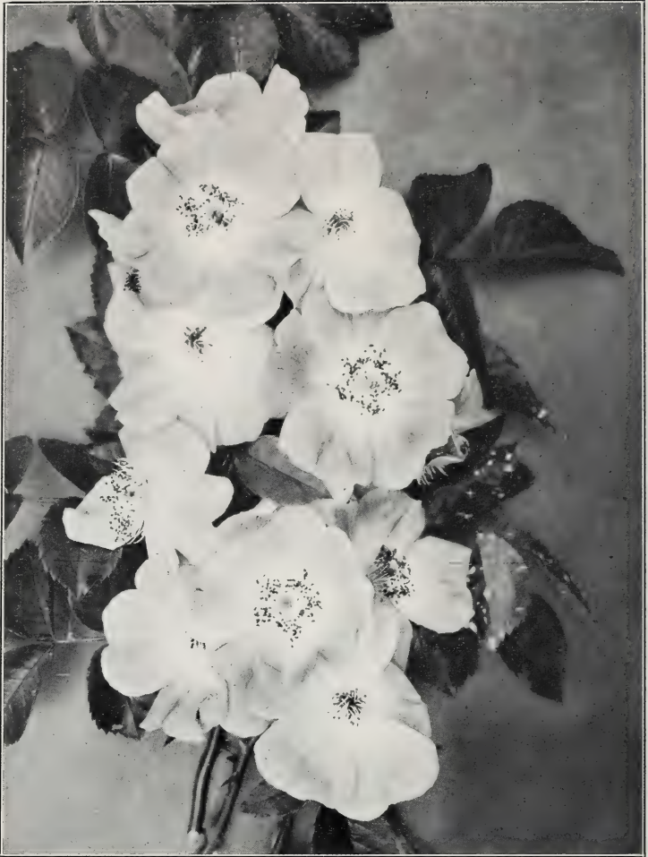
AMERICAN PILLAR ROSE