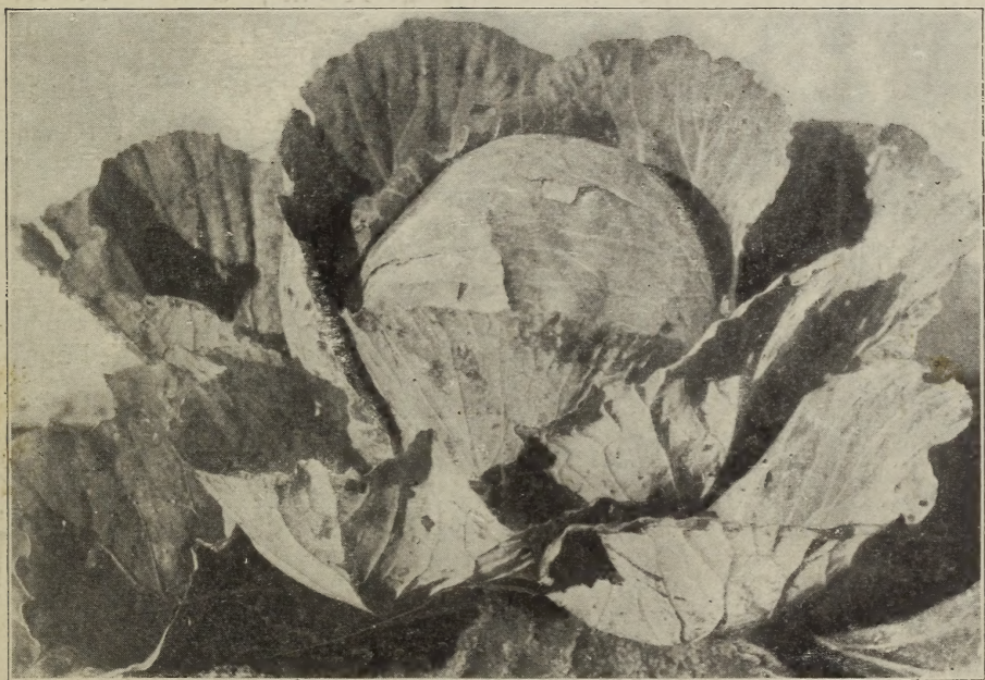
ENKHUIZEN GLORY CABBAGE The largest and earliest round head cabbage

For Market Gardeners and Commercial Growers