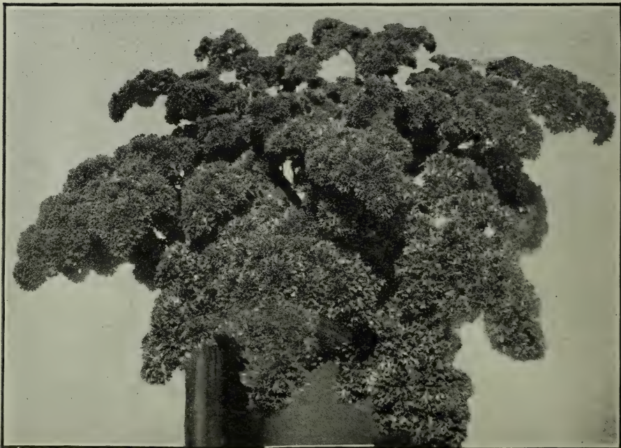
Dwarf Perfection Parsley.