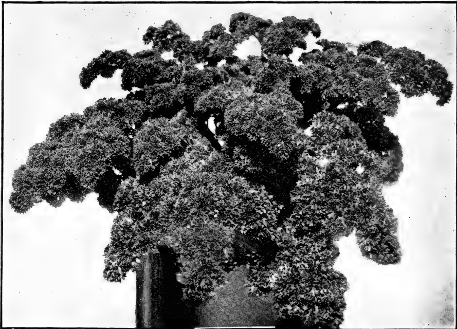
Dwarf Perfection Parsley.