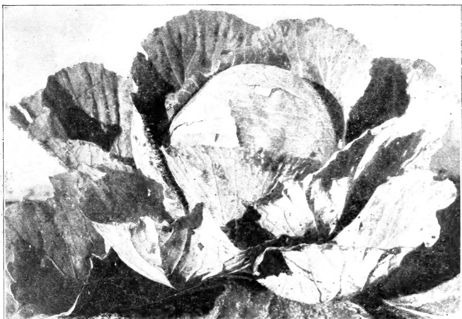
ENKHUIZEN GLORY CABBAGE The largest and earliest round head cabbage

For Market Gardeners and Commercial Growers