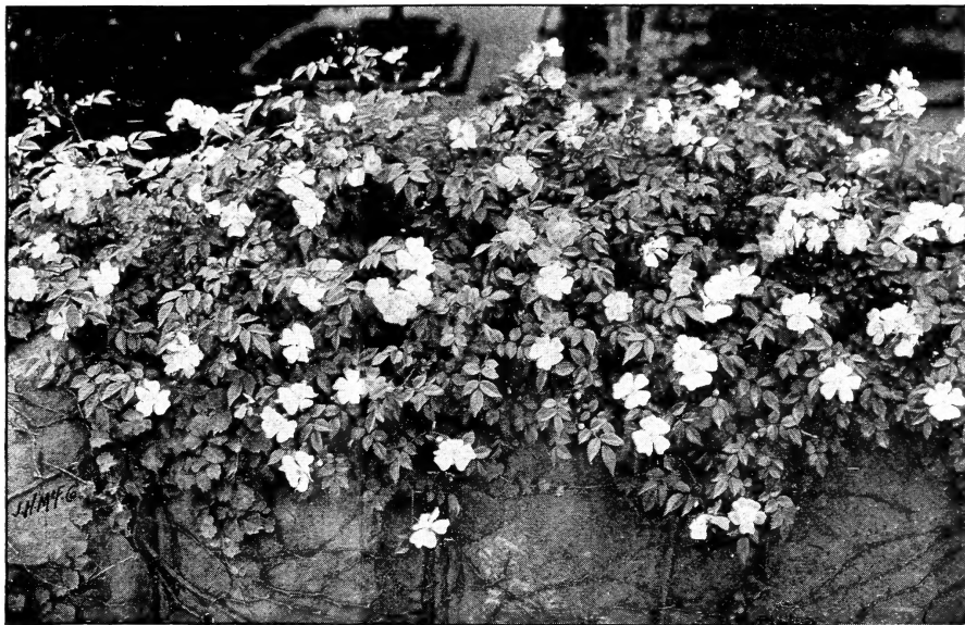
Rosa Wichuraiana clambering over a stone wall

THE beauty of the roadside covered with wild roses has often been sung, and nature provides not a more charming sight. With their beauty enhanced to the superlative degree, we have many kinds of these same "wild" roses, all of which are invaluable for producing beautiful effects in garden work, and some of which can be used to grow hedges; while others show their loveliness best when clambering over a stone wall or an old fence, or used to hide unsightly objects. They grow with the slightest care