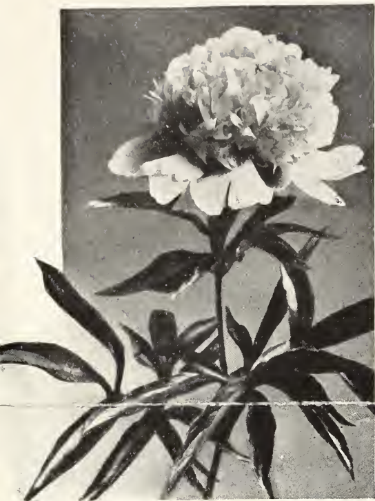
ALBA SULPHUREA A Beautiful Sulphur Yellow

L ARGE and showy without being coarse, ranging in color through almost every tint of pink, white, red and crimson, with even a startling approach toward yellow, the modern Peony rivals the rose in fragrance, beauty and variety of form. A collection of a few select varieties will supply an abundance of cut flowers, a yearly source of wonder and delight. Whether as specimen clumps on the lawn, among other perennials, or as an edging for shrubbery, the effect is charming. As a border for a walk or drive, or a low ornamental lawn hedge, they are unusual and attractive. On grounds of large extent bold masses are gorgeous, surpassing the rhododendron in size and magnificence of bloom.