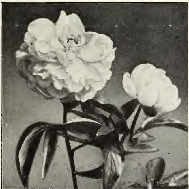
MARIE JACQUIN, the Water Lily Peony

We have other varieties of Peonies we do not catalog. If there is any particular variety you wish, write us. Perhaps we can supply it. We have quite a complete collection.