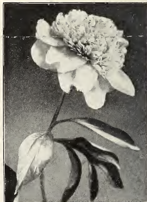
DUC DE CAZES

L'Esperance. —Beautiful rose pink of good size and form; full high tufted center; a very fragrant flower and one of the earliest Chinen-