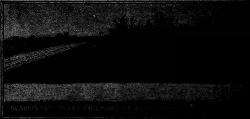
SCARF'S MODEL ORCHARD

We bought the Grand Champion 10 ears of Corn at the National Corn Show at Columbus, Ohio. We issue a free booklet with many fine illustrations from actual photographs. We also give the prize Corn to our customers absolutely free. Our catalog and Corn booklet free.