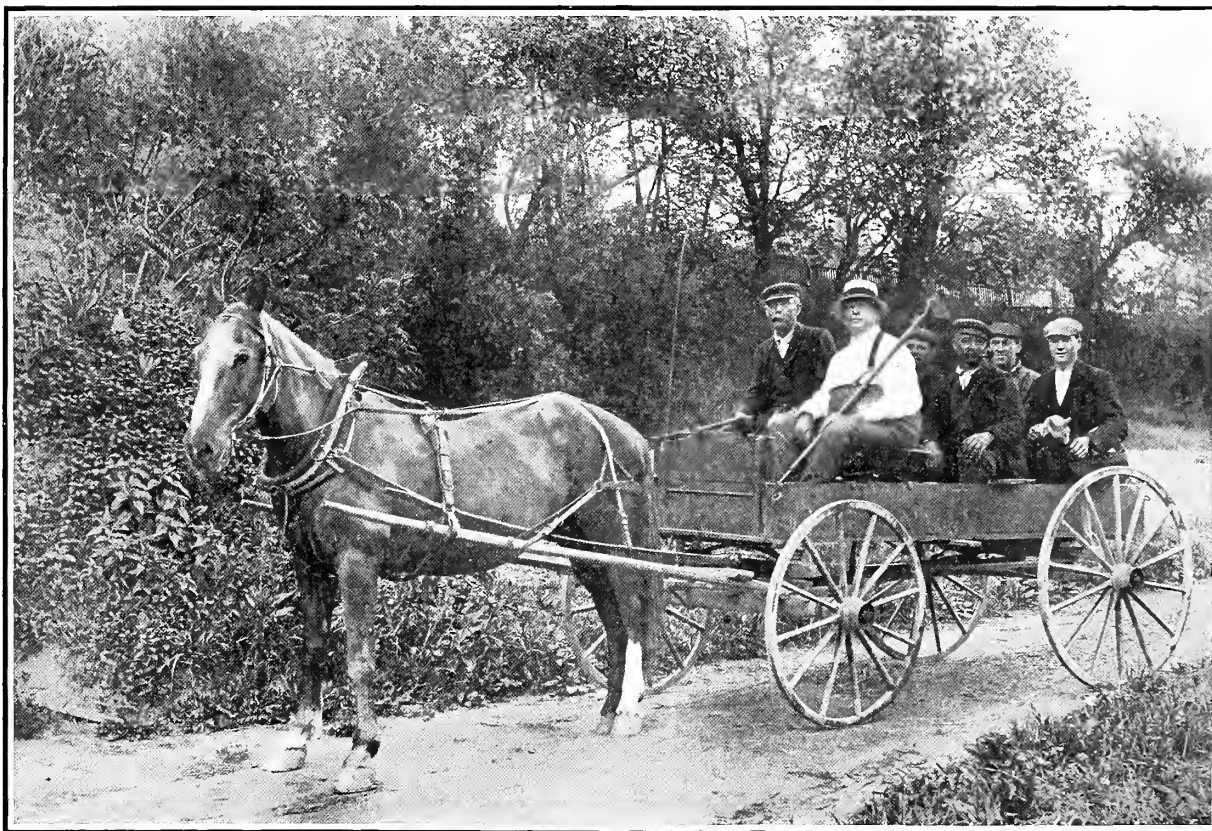
Going to Nursery---The Old Way