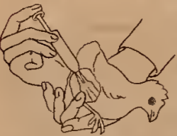
necessary to repeat this operation two or three times.

Grease around the vent. Give injection of from five to ten drops of warm water. After bowel moves inject "Oculum," using dose indicated on cut of syringe for the age of fowl being treated. Hold chick in your hand for at least a minute to prevent voiding the Oculum. In severe cases it may be necessary to repeat this operation two or three times.