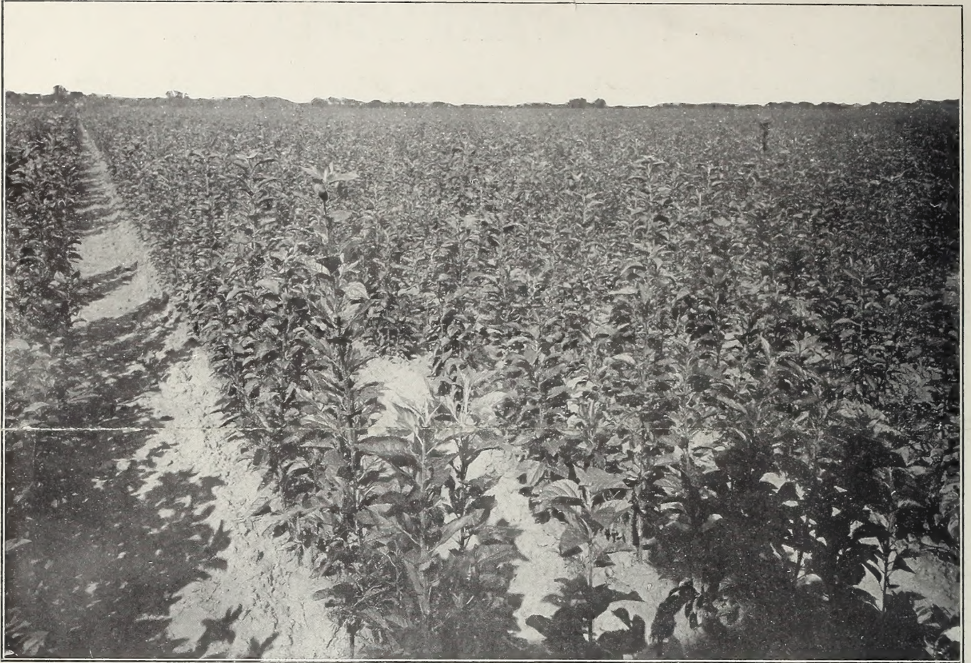
APPLE SEEDLINGS.—These Are the Identical Stocks We Are Offering.