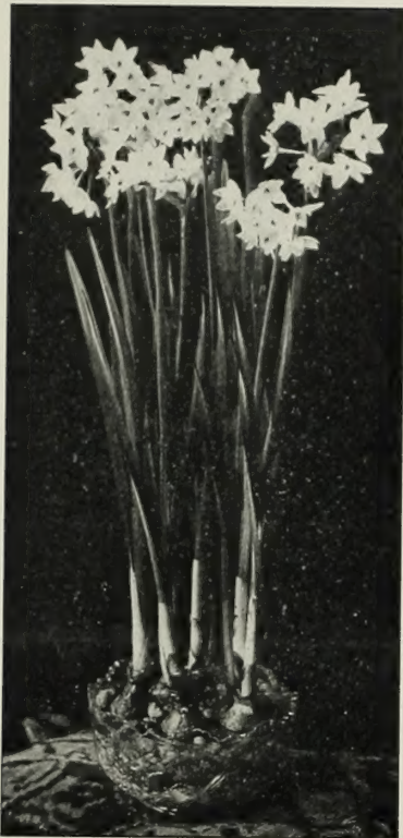
Narcissus (Indoor Culture)