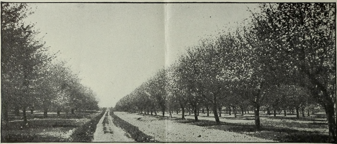
A view of the Collamer Apple Orchard at Hilton, N. Y. Note the clean cultivation.