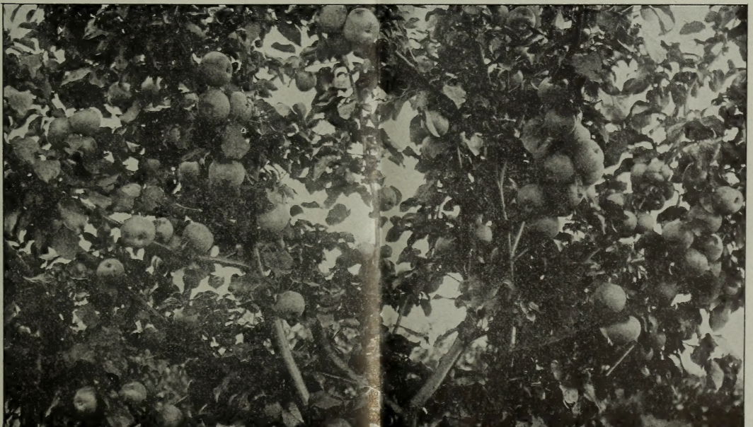
This is the way the apples grow on vigorous trees. Green's trees have always been noted for their vigor and hardiness.