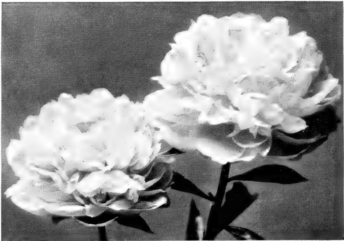
LIVINGSTONE (See Section F, page 25)

TENUIFOLIA FLORA PLENA. A most unusual Peony, blooming about two weeks in advance of the Chinese. The flower is of only moderate size, very full and of a bright crimson-red. In addition to its extreme earliness its chief charm is in its delicate fern-like foliage. Slow, dwarf grower. 1 year, 60 cents; 2 year, $1.00.