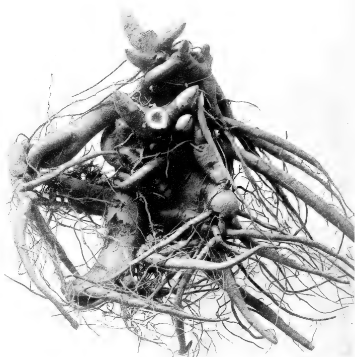
A DORMANT PEONY ROOT

or as specimen plants on the lawn, it is equally at home. It is particularly attractive when used to border a drive or walk.