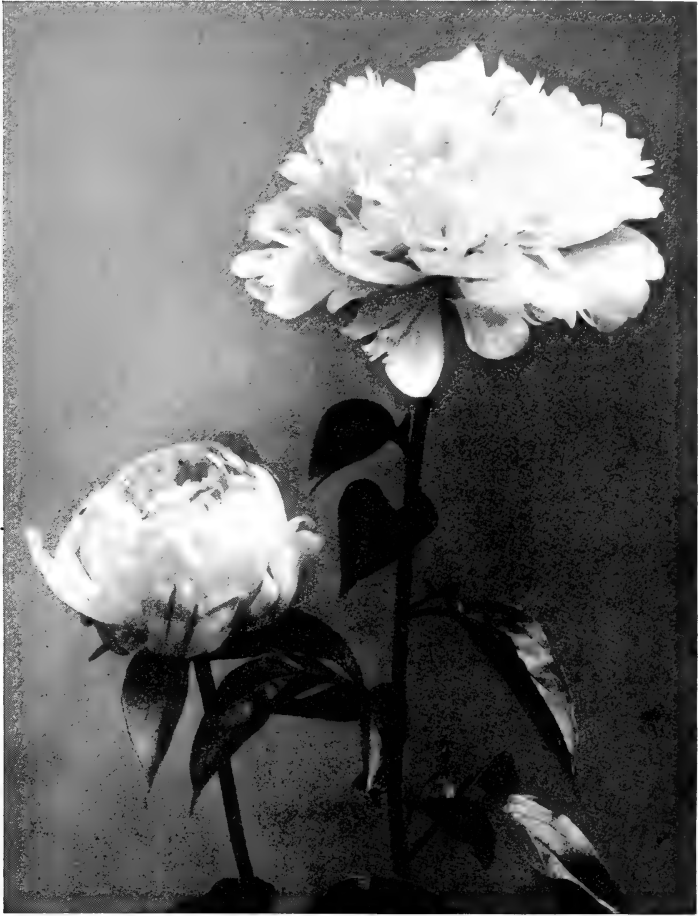
LA TULIPE (See Section C, page 17)