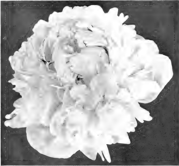
FESTIVA (See Section D, page 20)