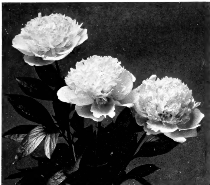
MAD. DE VERNEVILLE (See Section D, page 21)