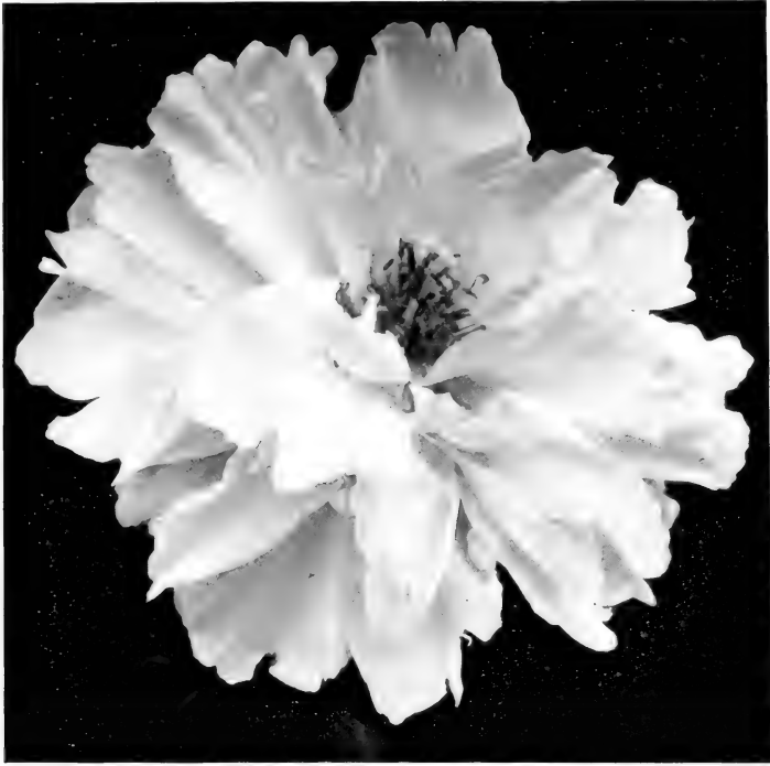
LA ROSIERE (See Section F, page 24)