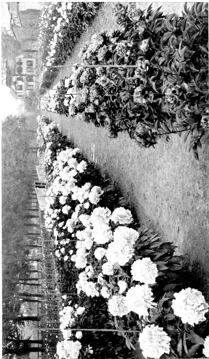
The above is an exact photographic reproduction of a portion of my new Exhibition Peony Garden as seen the past June, now in its third year. To those who have preserved last year's catalogue, it will be interesting to observe the wonderful development from the second to third year. The unsightly canopies are merely temporary coverings to protect from sun and rain two rare varieties.