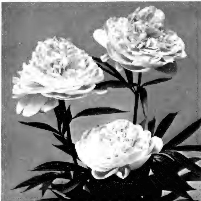
MODELE DE PERFECTION (See Section F, page 26)