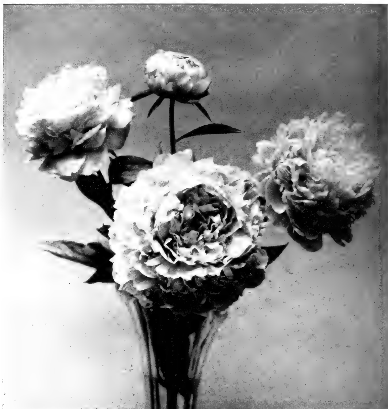
MAD. CHAUMY (See Section C, page 17)