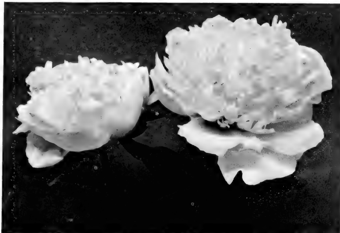
DUCHESS DE NEMOURS (See Section D, page 19)