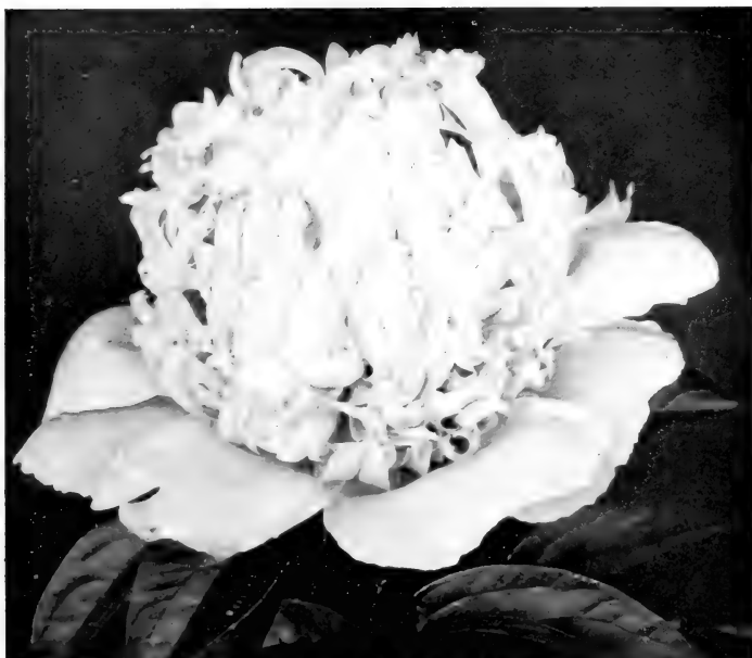
MAD. DUCEL (See Section F, page 25)

MARIE JACQUIN. Glossy, flesh-white, with rosy tinge to bud. Exquisitely beautiful, moderately full, cupped flower, retaining this form. Flowers on newly set plants and weak growths often come near single. With its wealth of golden stamens in center, this flower suggests our native pond lily. Fragrance very rich and languorous. Very distinct and fine. One of my prime favorites. 1-2-3.