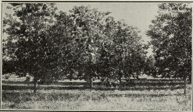
The above picture shows some of the largest seedling trees. This picture was taken four years ago. Note size of trees in comparison to the double turn-out.