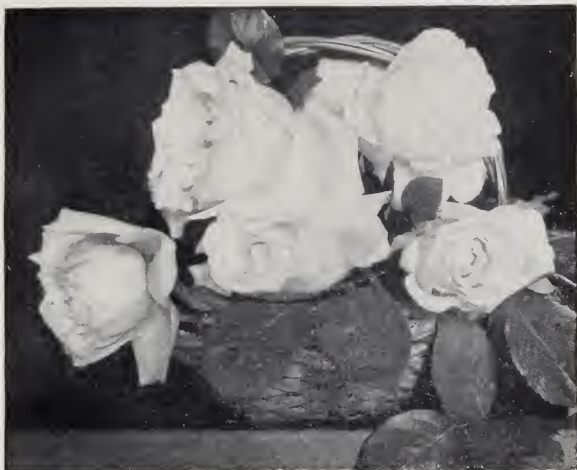
Basket of Tea Roses

out entirely, and strong shoots pruned to about one-third of their length, being careful to have an eye looking outwards at the extremity. In case of standards, closer pruning should be resorted to, leaving only about 3 inches of the previous year's growth. Hybrid Tea and Tea Roses should be pruned a little more severely. If large blooms are desired, pinch off most of the lateral buds as soon as large enough to handle.