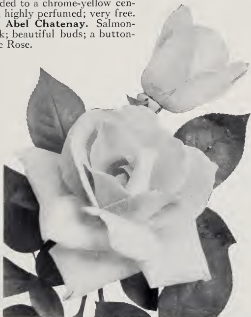
Killarney (see page 6)

Mad. Abel Chatenay. Salmon-pink; beautiful buds; a button-hole Rose.