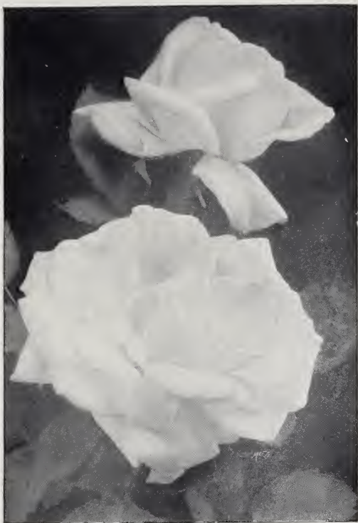
Frau Karl Druschki