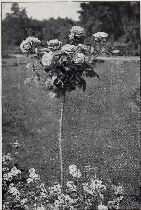
Tree or Standard Rose

It is necessary to give Standard Roses some support, and a stake about the same thickness as the Rose-stem should be used. This should be fixed on the south or sunny side, in order to afford some protection to the stem from the heat of the sun.