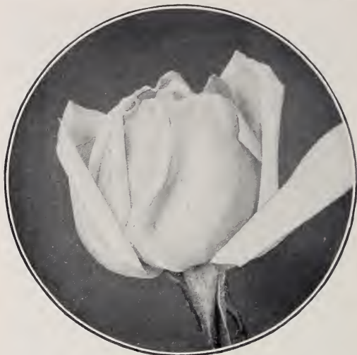
Flower of Etoile de Lyon