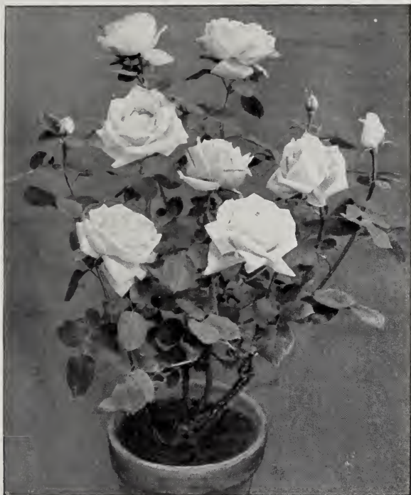
Frau Karl Druschki in Pot