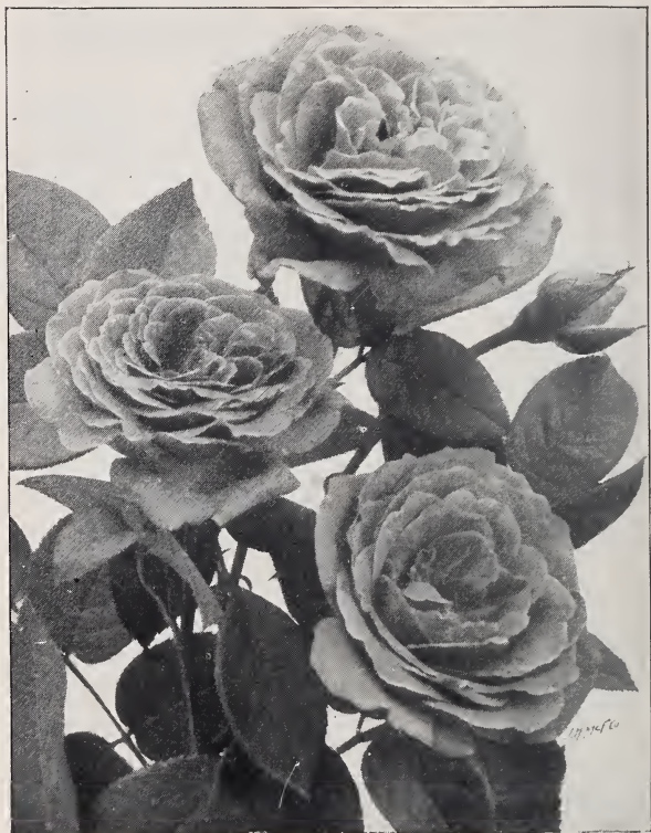
Gruss an Teplitz

Pharisaer. Very pale rose, deepening toward center; finely formed bud and flower.