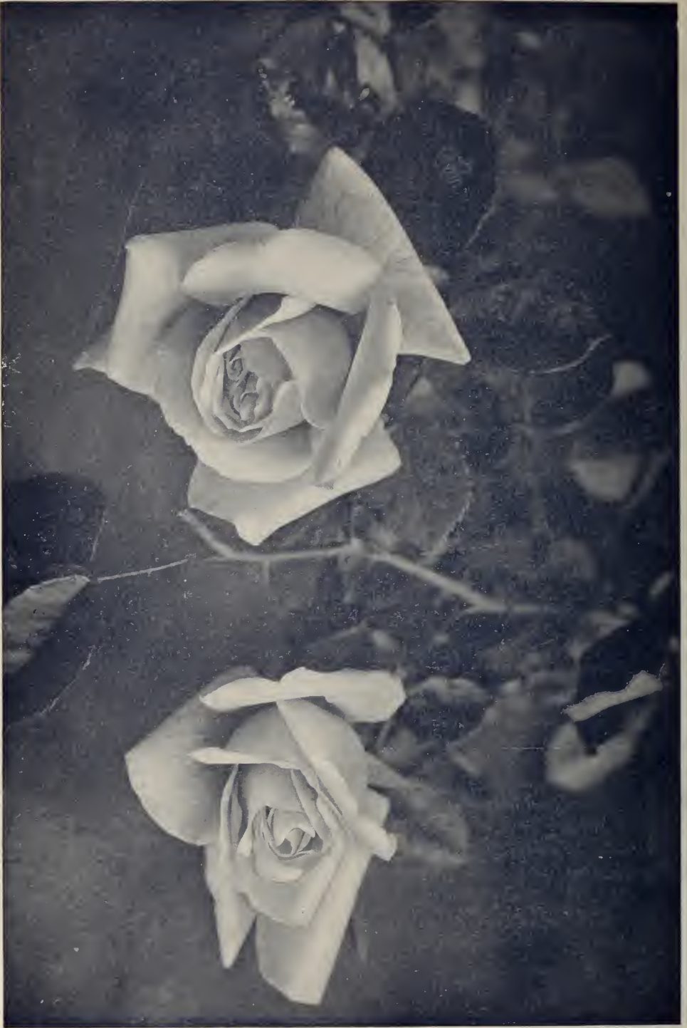
GOLDEN TROPHY (See page 19)