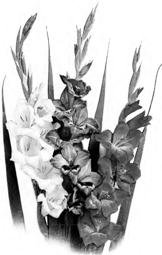
Three spikes from my Silver Trophy Strain (see page 15)