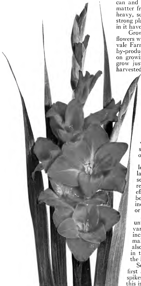
War—a deep blood-red Gladiolus

See that the plants have plenty of water when they first appear above ground and later when the flower-spikes begin to show color. Keep free from weeds. If this is done they will require no other care. However, an occasional stirring of the soil around them will be an