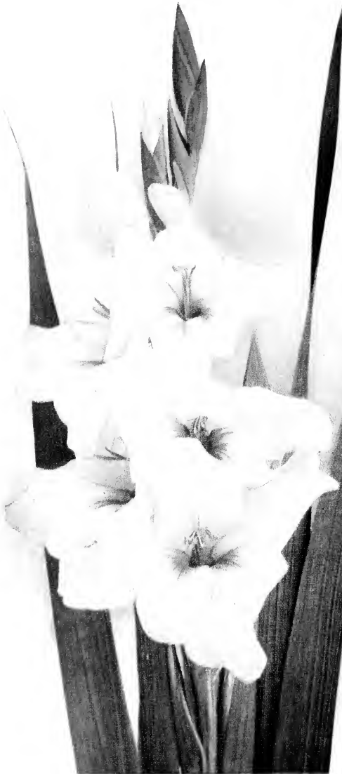
Peace (see page 11)

When I remembered the modest, rather commonplace Gladioli of my grandmother's garden—flag-lilies we boys called them—quite little flowers of a salmon-red, and then looked at the great blossoms crowded around me in such exquisite and infinite variety of tints, it was hard to realize that these were not of another family, a distinct and separate race. But they were not. They were