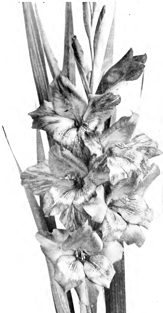
Intensity Gladiolus (see page 10)

Postpaid, 25 bulbs $3.25, or 50 bulbs $6.25. Express collect, 100 bulbs $12. If by express, 25 at 100 rate.