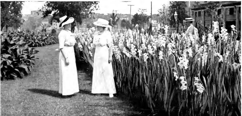
Another view of a planting of Peace, at Minneapolis

Canary-Bird. Fine light yellow. $7 per 100. Ceres. White, spotted with purplish rose. $2 per 100, $18 per 1,000. Claude Monnet. Violet, three lower petals marked with crimson. $15 per 100. Contrast. Intense scarlet with white center. Very striking. $25 per 100. Cracker Jack. Dark red, throat spotted with yellow and maroon. $20 per 100. Cremilda. Delicately tinted pink on creamy white background. $15 per 100. Dawn. (Groff's.) Delicate salmon, shading to white inside, claret stain on inferior petal. 60 cts. each, $6 per doz. (See illustration, p. 7.) Daytona. (1025.) A beautiful mauve, shaded darker toward base of petals, the lower petals marked with peacock feathering. Large flowers; the graceful bending of the spikes makes it most desirable for jardinière decoration. 50c. each, $5 per doz. Dimmock, A. Delicate salmon, deepening in throat. $20 per 100. Eldorado. Deep, clear yellow, lower petals spotted maroon and black. $15 per 100. Emma Thursby. Carmine stripes on white ground. $4 per 100. Eugene Scribe. Tender rose, blazed carmine-red. $5 per 100.