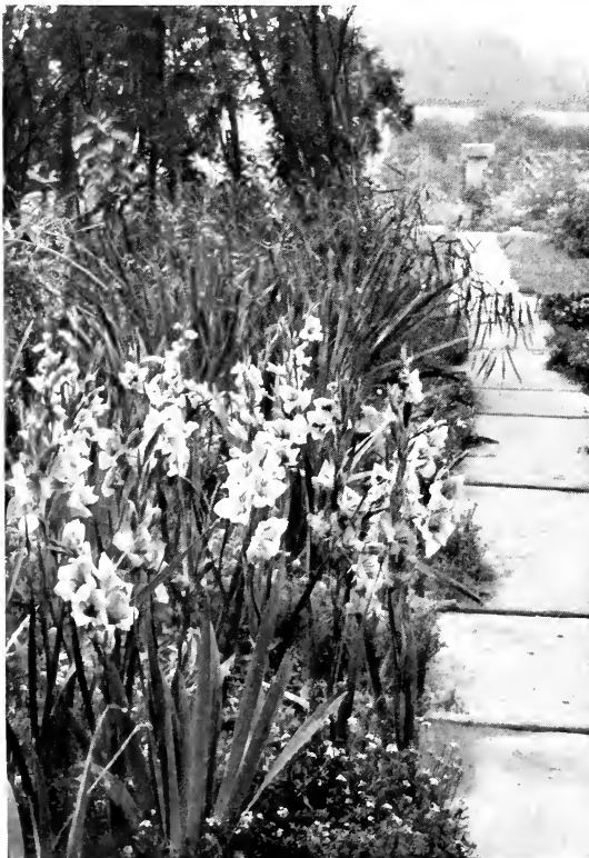
Gladioli are superb for a garden border

I have seen the Gladioli in their glory. I have come to share with the master of those glorified fields something of the enthusiasm which has made him known far and wide as the Gladiolus specialist. I have had just a peep into the fascinating possibilities which, through the alchemy of Nature, are open to the grower of this truly royal flower.