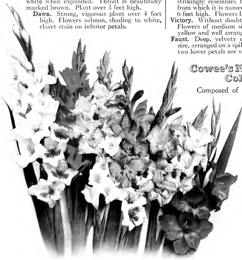
Ten named Gladioli for 50 cents (see page 15)

Taconic. Bright pink, flecked and striped; lower petals crimson, shading into lemon-yellow.