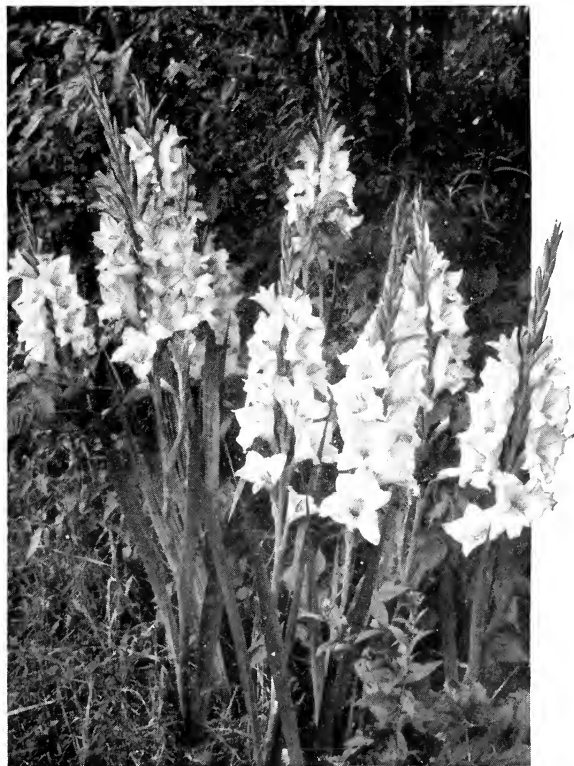
Grouping of Gladioli in garden border

At the same time, no plant responds more quickly or satisfactorily to good treatment. It likes best a rich, sandy loam. If your soil is heavy or stiff, work in a liberal amount of sand. If it is very light and sandy, spade in a liberal amount of well-rotted manure in the fall. Best results are obtained by preparing the beds in the fall. This is especially true when thoroughly rotted manure is not to be obtained and fresh manure must be used. By spring it is decomposed, and the ground in the very best of condition. Fall-turned sod makes an excellent foundation. If not fall-prepared, the land should be given a liberal dressing of manure or commercial fertilizer, and this spaded in to a depth of 15 inches.