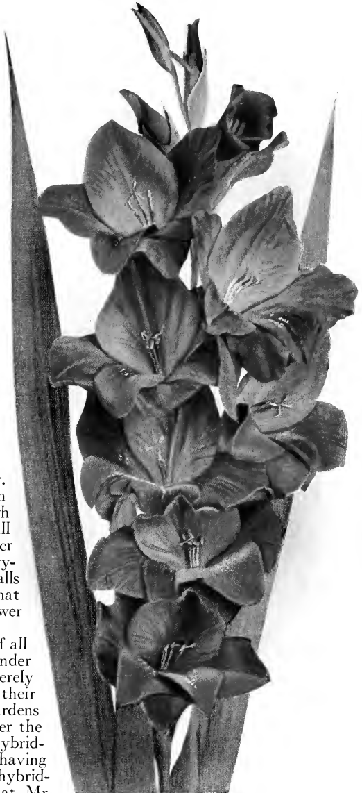
Faust—deep velvety crimson flower (see page 10)