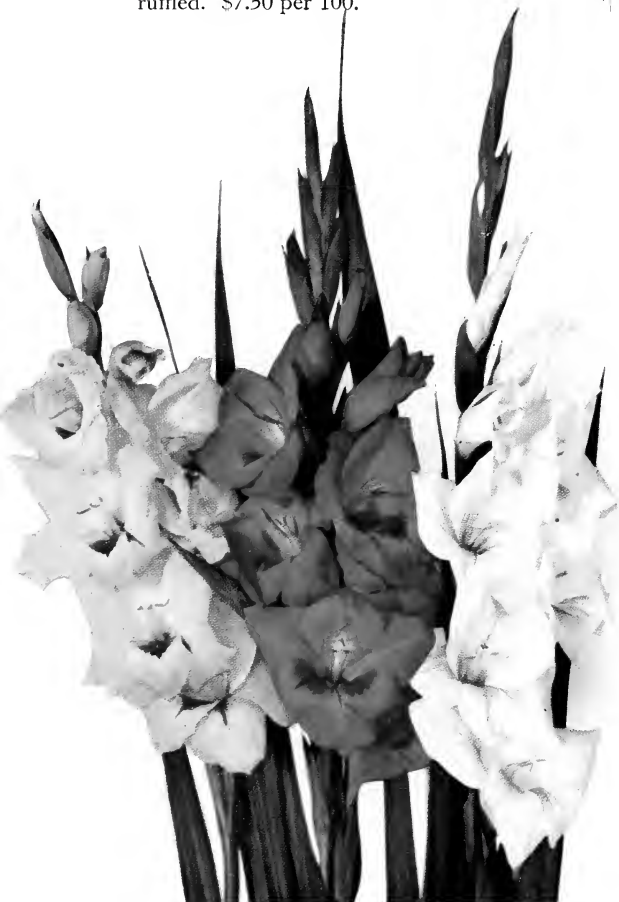
"Glory of the Garden" Collection (see page 13)