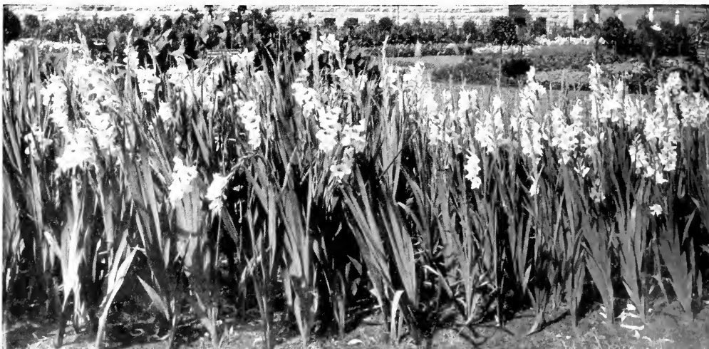
A planting of my Gladiolus Peace, at Minneapolis, in 1913

To those having little or no acquaintance with the modern Gladiolus I suggest a trial of one of my collections of named varieties. In each of these groups the selections have been made with a view to harmony of colors, at the same time giving the customer a variety typical of the very best in its class. My one object is to make each collection the very best value for the price. I believe there is no better way to become acquainted with this superb flower and to see what it is when brought to its highest perfection than through one or more of these collections. Only clean, sound bulbs of large size, selected with the utmost care are sent out.