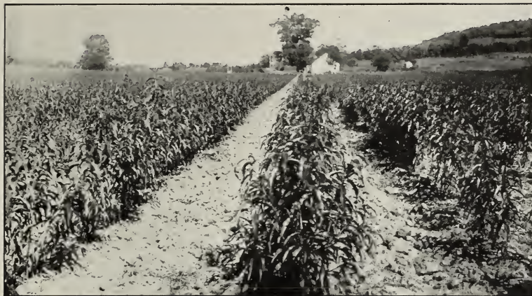
PEACH—JUNE BUDS PHOTOGRAPHED AUG. 3d Trees will average 3½ to 5 feet by end of growing season