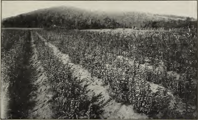
BLOCK OF ORNAMENTAL SHRUBS Including Hydrangea A. S. and P. G. on right