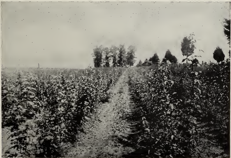
BLOCK OF FINE ROSES GROWN ON OWN ROOTS