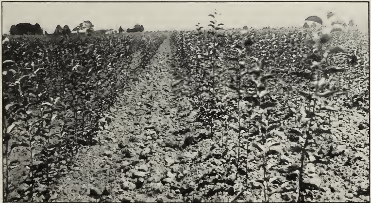
ONE-YEAR APPLE GRAFTED ON WHOLE No. 1 ROOTS

For digging with balls of earth and burlapping roots, add 5 cents per tree to above prices. It is always safest and best to handle evergreens in this manner.