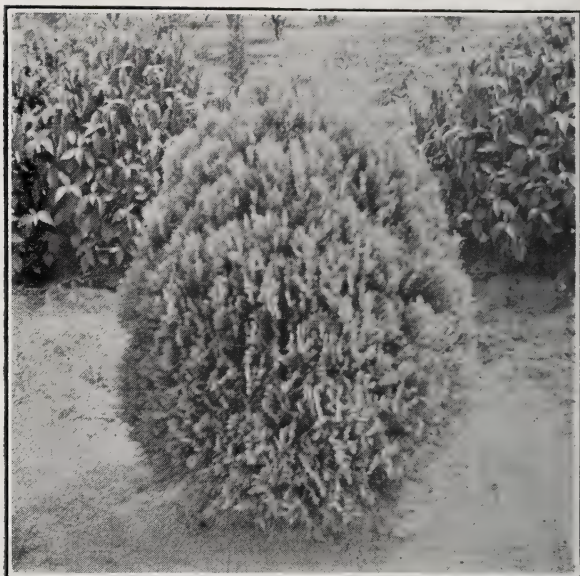
The hardy, compact Rosedale Arborvitae

JUNIPER. (Sabina Cupressifolia.) A juniper of creeping or trailing habit, bluish green, excellent for borders.