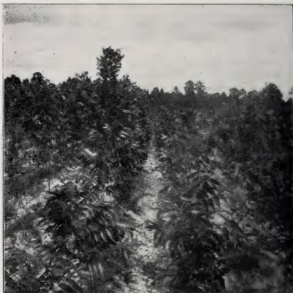
Stuart Pecans in Nursery

YUCCA. ( Y. Treculeana. ) A very rare and beautiful species from Mexico and Texas. Leaves thick and very rigid, of unusual length and blue green. Flowers ivory white, produced upon a compact stock in early April. Exceedingly difficult to propagate. Strong 3-year plants, 50c each; 5-year, $1.00.