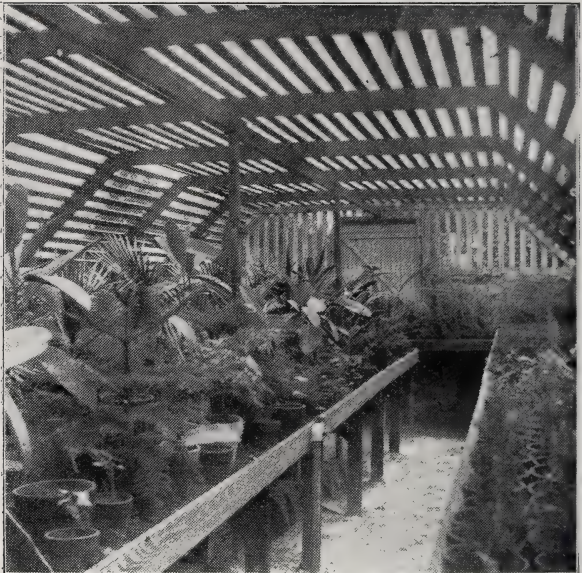
One of Our Plant Houses

SASSAFRAS. An ornamental deciduous tree, native of Florida. Resembling somewhat the Camphor. Tea made from the roots has a delightful flavor. With slight pruning makes a fine ornamental.