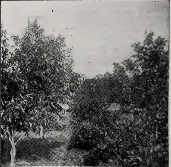
Showing variety orchard of Pecans and Satsumas; being a portion of our Test Pecan Orchard, containing over 40 varieties

CHERRY LAUREL. ( P. Carolina. ) A brilliant glossy-leaved evergreen tree. Grows compact with well shaded, rounded head. Is specially desirable for yard specimens, where it can be trained into various shapes and forms as desired. Is largely used as a hedge plant.