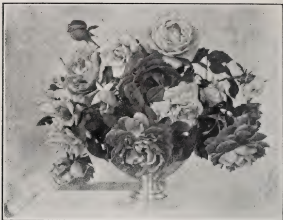
The Queen of Flowers—One of Our Leaders

BEAUTY OF WALTHAM. (H. P.) A bright cherry-red rose, large fine formed flowers. Good grower and bloomer.