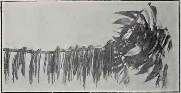
Heavy Male Bloom of Pecan—Teche Variety