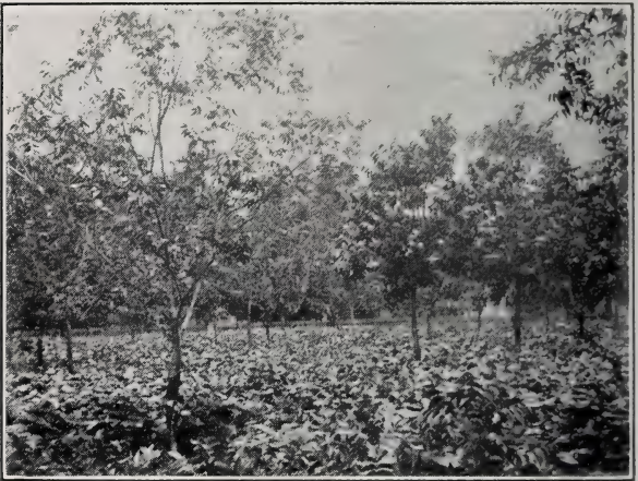
Cow-Pea Cover Crop in Pecan Orchard

PEACHES give us the quickest results of any of the fruits. Well planted and cared for, should commence to bear the next year after planting. They flourish over a wide range of soil and climatic conditions. It is but a question of selecting varieties adapted to the latitude desired. Georgia varieties give poor results in Florida, and vice versa. We offered last season for the first time, peach trees grown on the plum stock, root-grafted. This has proven a decided success where old land must be used, as it eliminates the question of root-knot, which is so fatal to these trees in old land. Our stock of peach on this stock is very limited this season. Varieties offered ripen in order named. Jewel, Waldo, Angel, Millen's Favorite and Golden Cling.