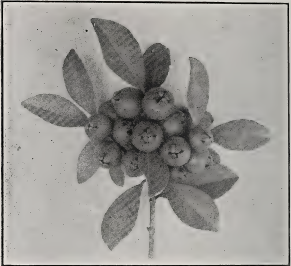
Prolificness of the hardy Cattley Guava