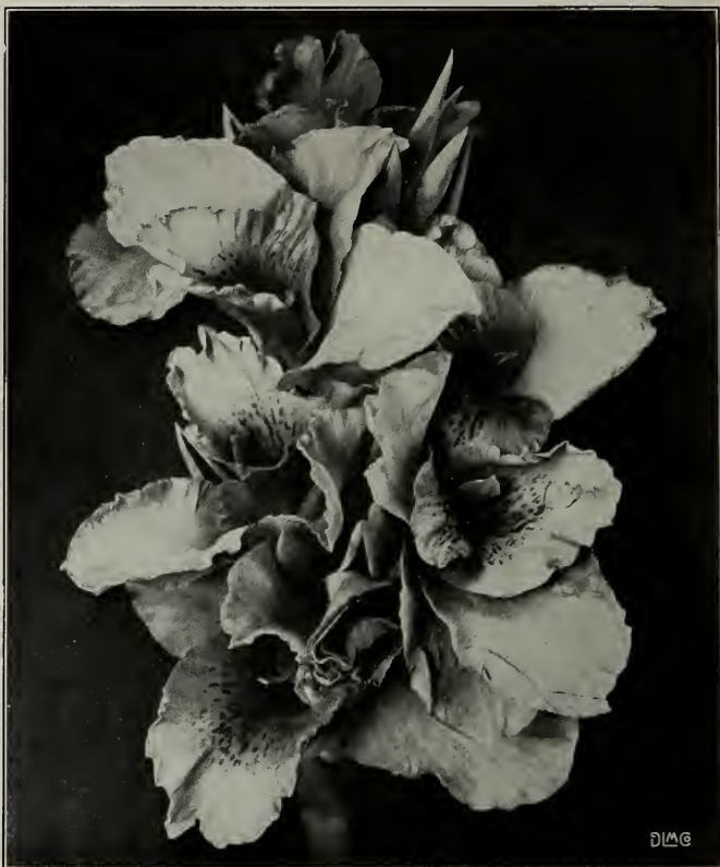
Canna, King Humbert