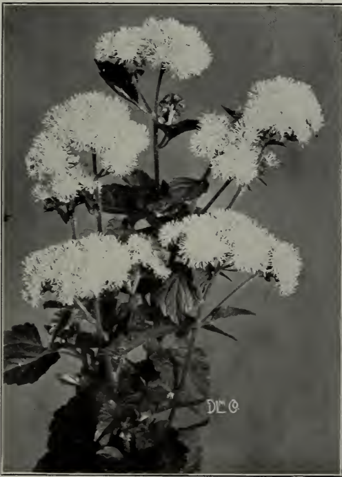
Ageratum, Princess Paulin

Out of 2¼-in. pots: $3.00 per 100, $25.00 per 1000.