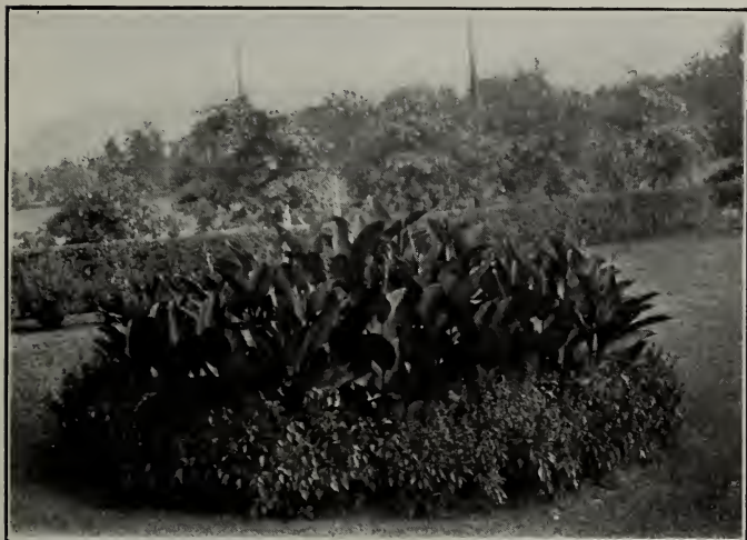
Canna Bed with Salvia

Very free Summer-blooming variety. $2.25 per 100, $20.00 per 1000.