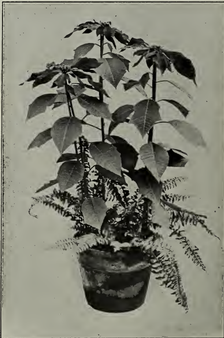
Poinsettia with Boston Fern