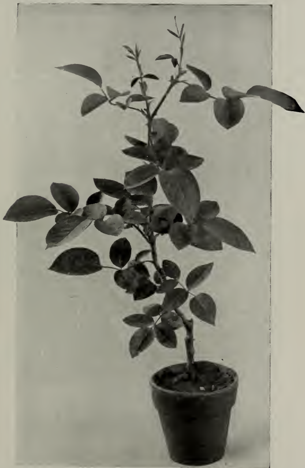
Sample Grafted, 2¼-in.

Own Root: 2¼-in., $1.50 per doz., $12.00 per 100, $100.00 per 1000.