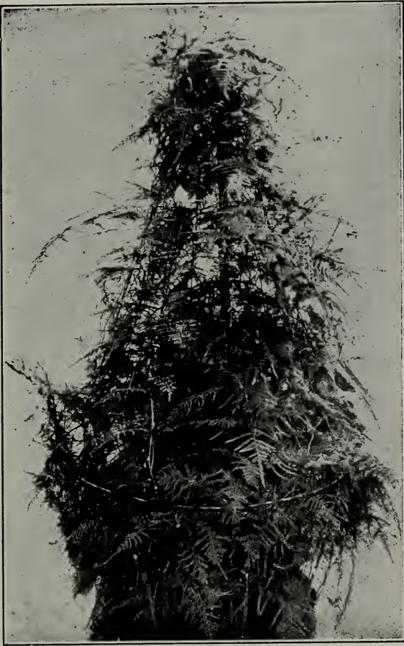
Asparagus Plumosus Nanus