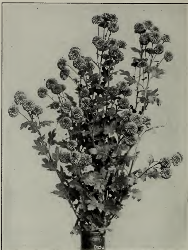
Pompon Chrysanthemum, Baby Margaret