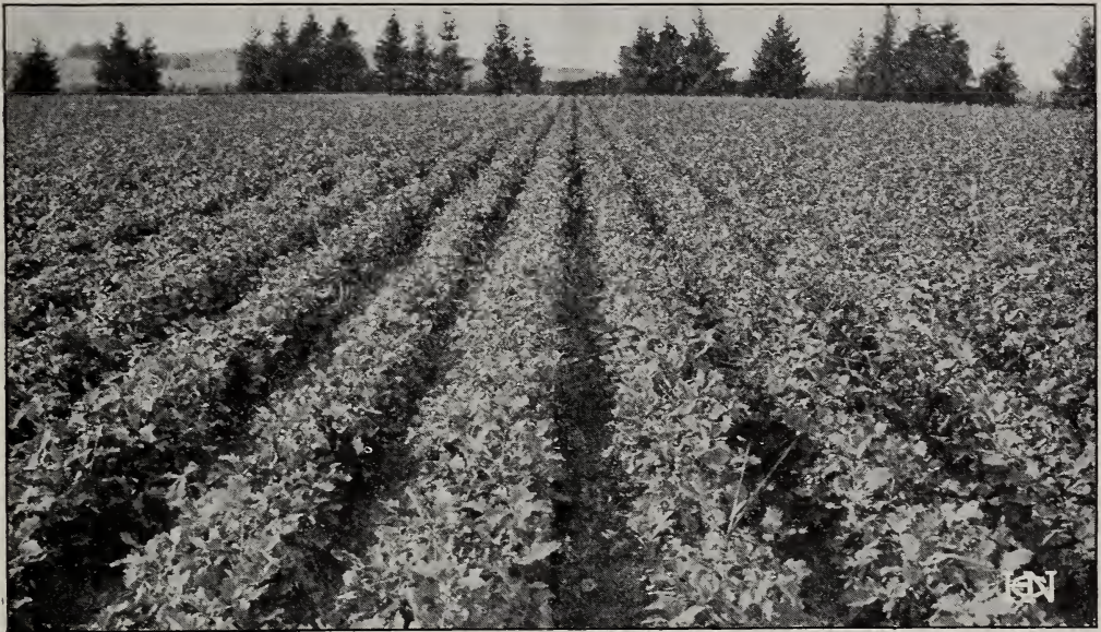
Blocks of Deciduous Forest Tree Seedlings in Hill Nursery.