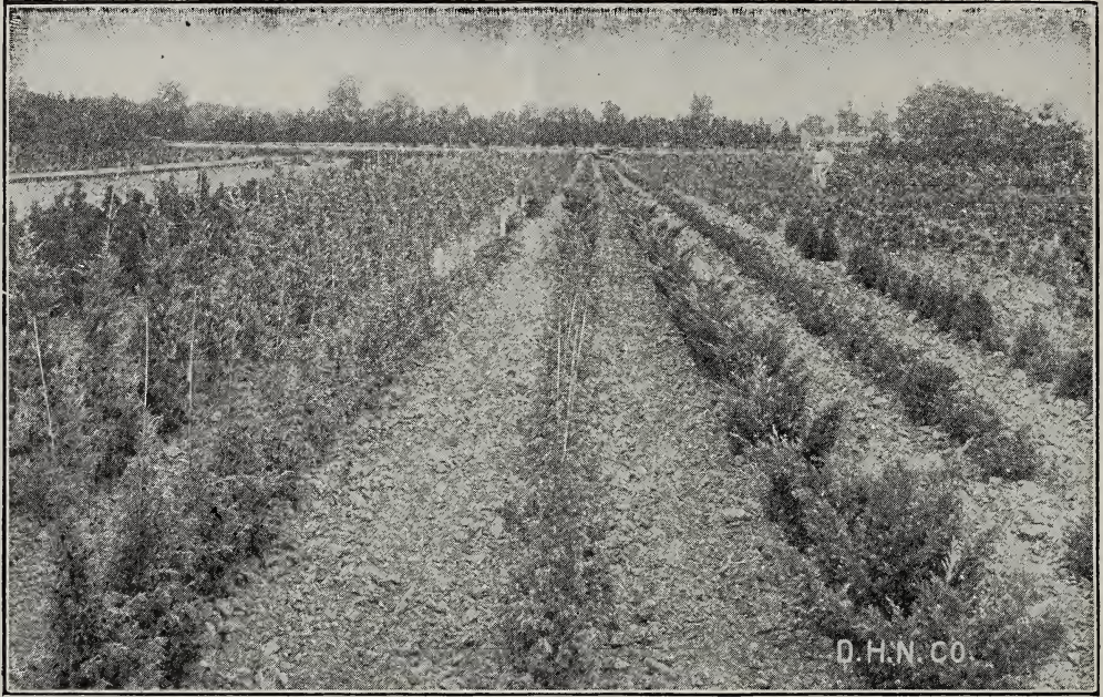
Blocks of Specimen Evergreens, principally Junipers, Hemlocks and Pines.