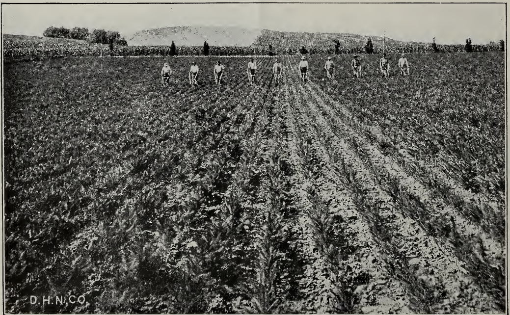
The hand cultivators at work in block of 1,000,000 transplanted Norway Spruce.