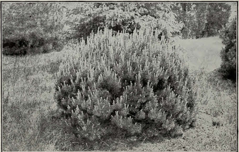
Pinus Mugho—Dwarf Mountain Pine (true type.)