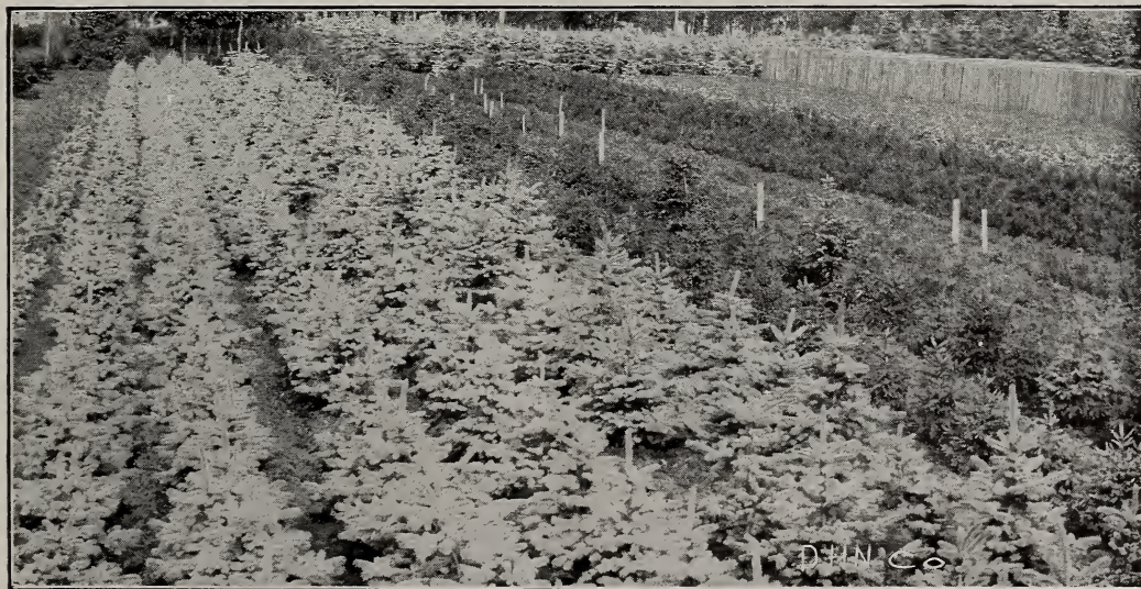
Blocks of Blue Spruce Trees in Hill Nursery.