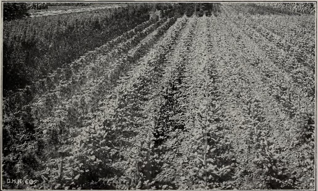
Blocks of Specimen Evergreens in Hill Nursery. Blue Spruce in foreground.