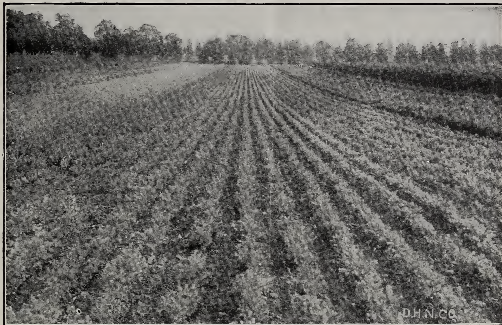
View in Hill Nursery—In this section are shown young transplanted Douglas Fir in foreground, Norway Spruce to the left and to the extreme right American Arbor Vitae.