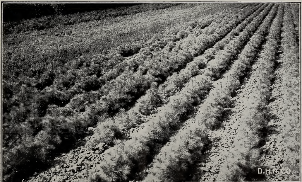
500,000 transplanted White Pines in Hill Nursery. These trees are 4 year olds. Once transplanted and once root pruned—insuring fine roots.