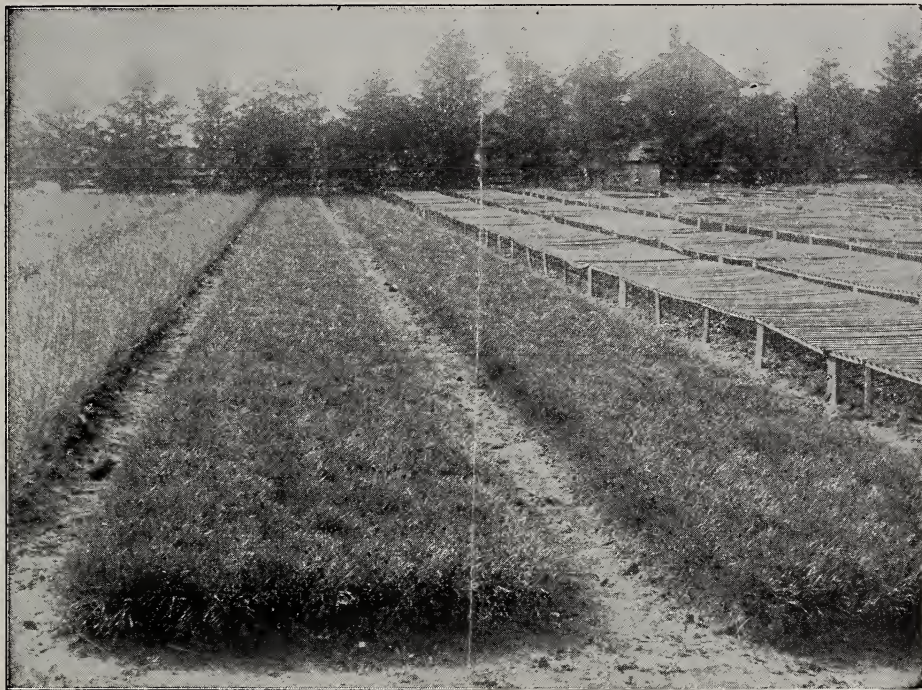
Seedling Beds in Hill Nursery. European Larch at left; Scotch Pine in Center. One year White Pine under racks at right.