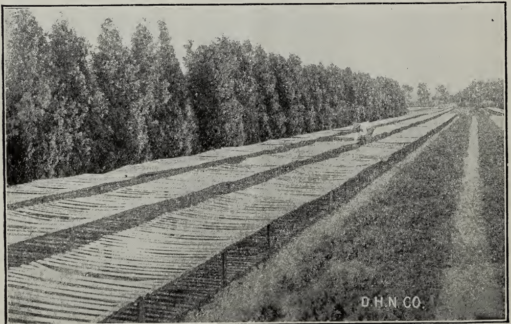
One and two year old White Spruce and American Arbor Vitae seedlings.

The above points constitute the difference between 100 per cent stands and 50 per cent stands. Try Hill's trees this year—AND SEE THE DIFFERENCE.