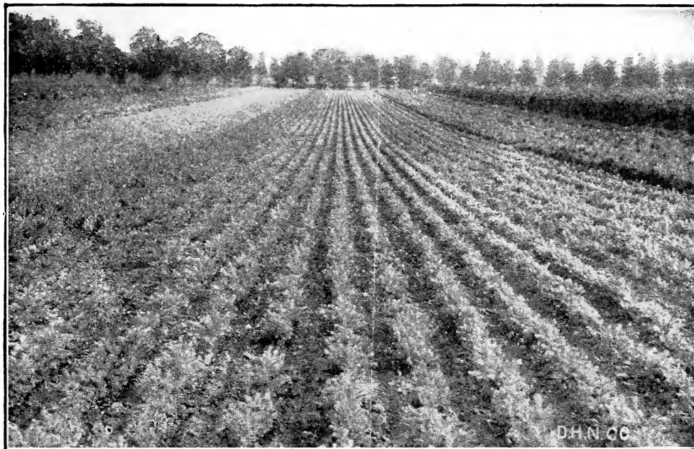
View in Hill Nursery—In this section are shown young transplanted Douglas Fir in foreground, Norway Spruce to the left and to the extreme right American Arbor Vitae.