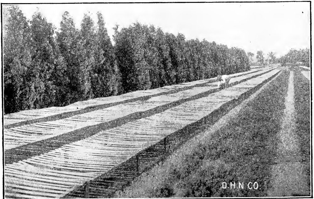
One and two year old White Spruce and American Arbor Vitae seedlings.

Try Hill's trees this year—AND SEE THE DIFFERENCE.