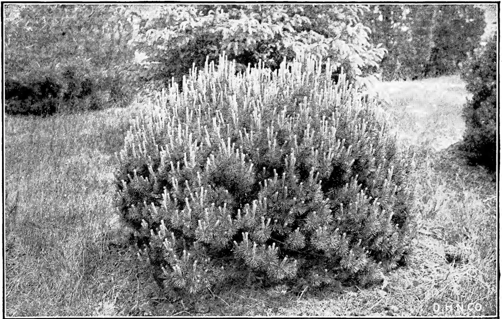
Pinus Mugho—Dwarf Mountain Pine (true type.)