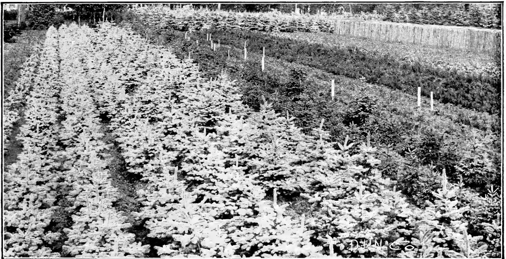
Blocks of Blue Spruce Trees in Hill Nursery.