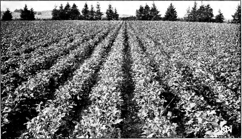
Blocks of Deciduous Forest Tree Seedlings in Hill Nursery.