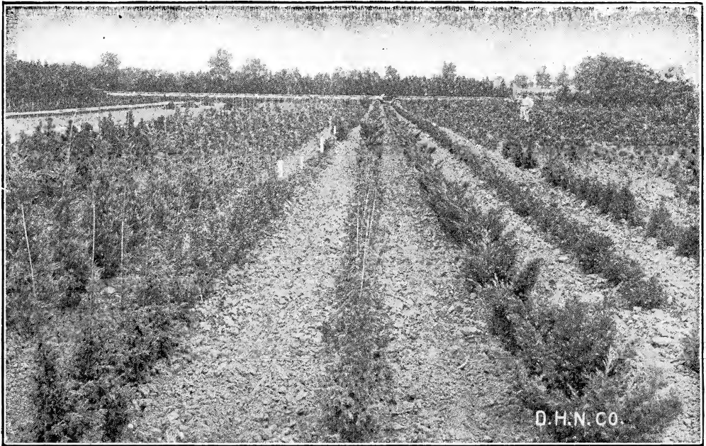
Blocks of Specimen Evergreens, principally Junipers, Hemlocks and Pines.