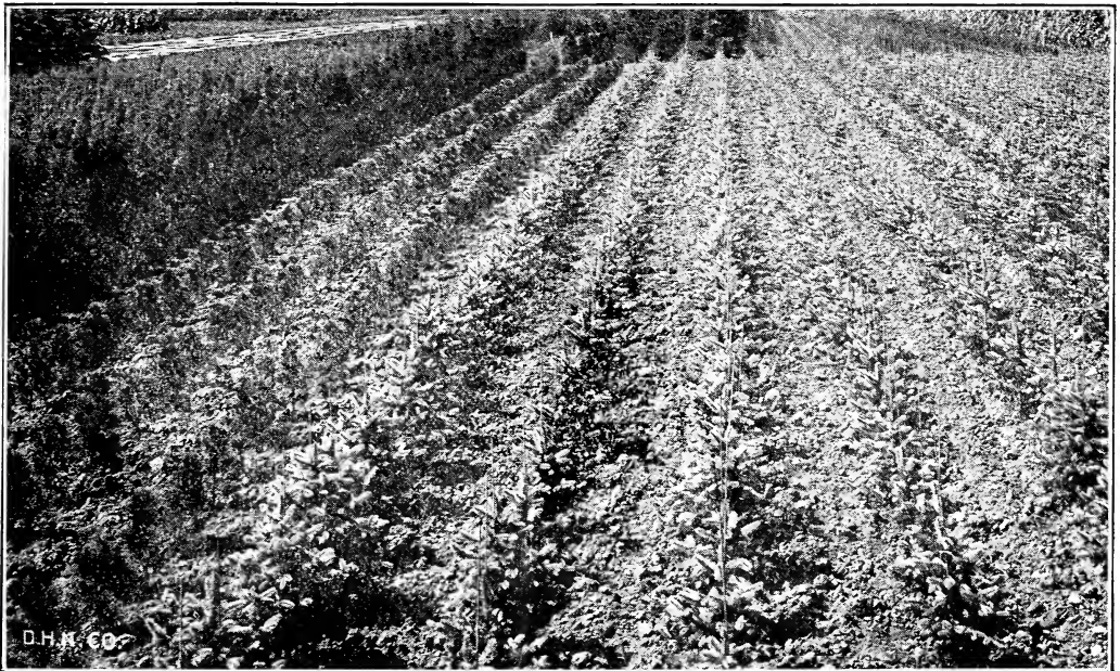
Blocks of Specimen Evergreens in Hill Nursery. Blue Spruce in foreground.