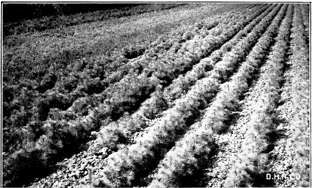
500,000 transplanted White Pines in Hill Nursery. These trees are 4 year olds. Once transplanted and once root pruned—insuring fine roots.