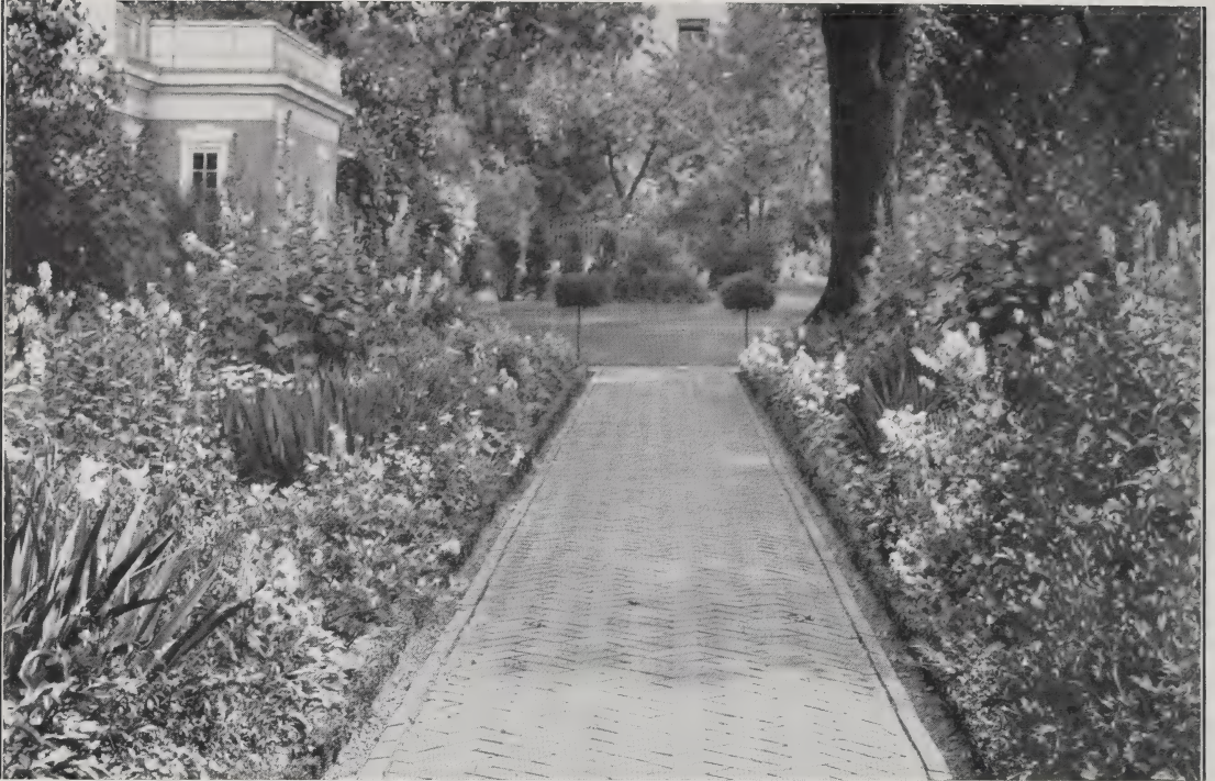
VIEW OF GARDEN SHOWING BORDERS OF HARDY PERENNIAL PLANTS

Hardy Perennials are most intensely interesting, and the same plants endure from year to year, growing larger and blooming more profusely as time passes by.