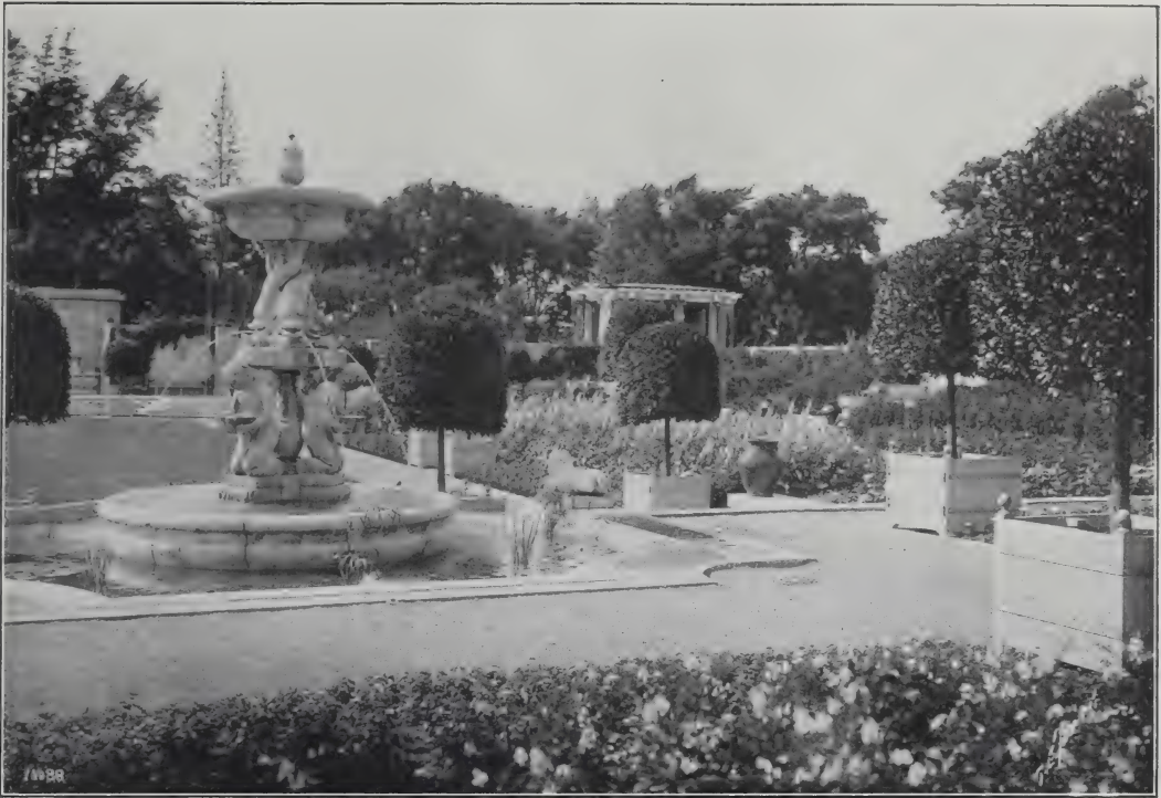
An Attractive Garden with STANDARD BAY TREES in Prominence

BAY TREES. Very fine evenly matched specimens of both Standards from 2 feet to 6 feet diameter of head, and Pyramids from 4 feet to 14 feet in height and other sizes, including a few pairs of Grand Specimens , the largest and finest yet sent out in this country. All our Bay Trees are specially selected for our own direct importations. Low prices per pair and per dozen. If interested write for quotation .