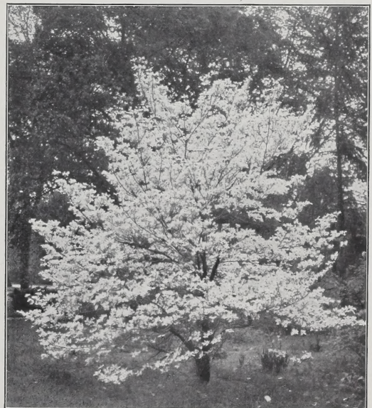
CORNUS FLORIDA—WHITE DOGWOOD

Kousa. JAPANESE DOGWOOD. A rare oriental variety. Creamy white flowers. $2.50 and up.