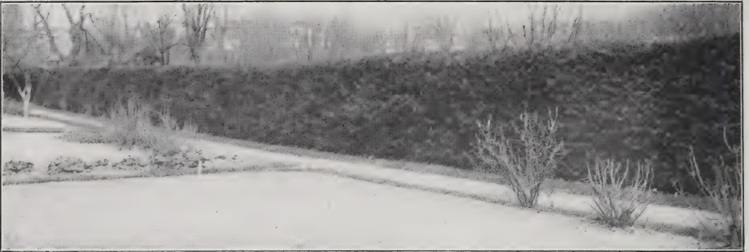
HEDGE OF NORWAY SPRUCE