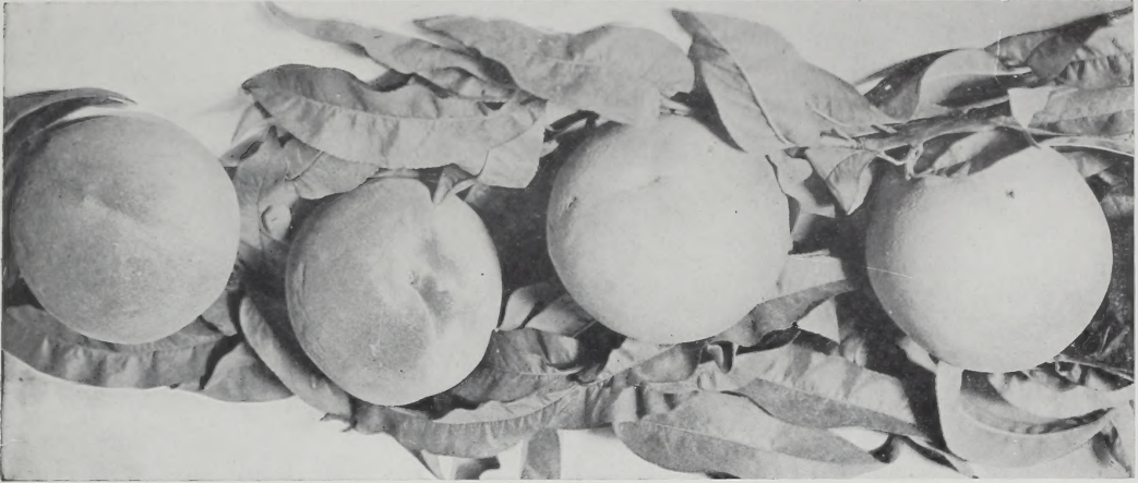
FRUIT FROM TRAINED PEACHES

Choice fruits for fruit houses are now largely in demand; and one of the features of all leading European gardens, the practice of planting trained fruit trees, is becoming popular in this country. The advantages of the trained fruits are manifold, among which may be mentioned—the bearing of fine fruits soon after planting; the quicker ripening of the fruit; better flavor of fruit; unaffected by the winds; they do not shade any part of the garden.