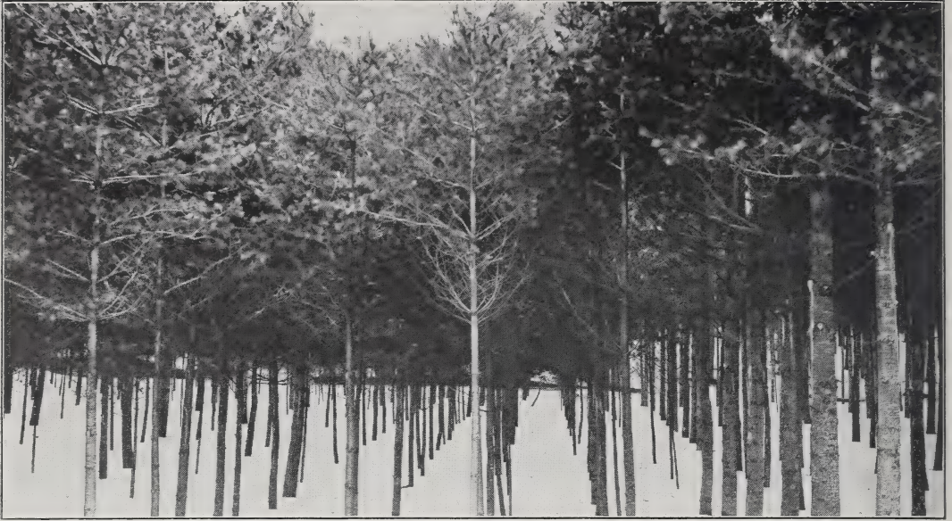
FORESTRY GROWTH OF WHITE PINES. Photograph taken 18 years after planting.

EVERGREEN STOCK. Seedlings and Transplants of first-class quality, strong, healthy, well-rooted and free from fungus or other injurious insect diseases.