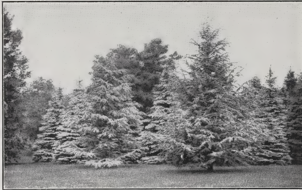
A grouping of our fine Evergreens, Cedrus Atlantica and Blue Spruce on a Long Island Estate

EVERGREENS, from the small Forestry Plants to the largest and choicest specimens, are a specialty of this Company and you should write us for quotation on your requirements.