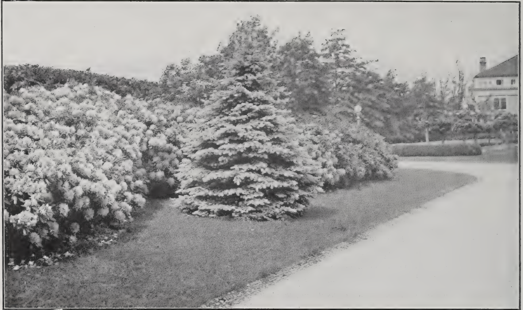
A border mass planting of our Hardy Hybrid Rhododendrons and Koster's Blue Spruce, Glen Cove, Long Island.

Rhododendron Hardy Seedlings. Assorted colors; good bushy transplanted plants from $50.00 to $100.00 per 100.