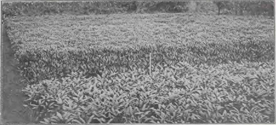
FINE BLOCK OF OUR HARDY HYBRID RHODODENDRONS IN NURSERY Extra fine Plants producing immediate effects where planted.