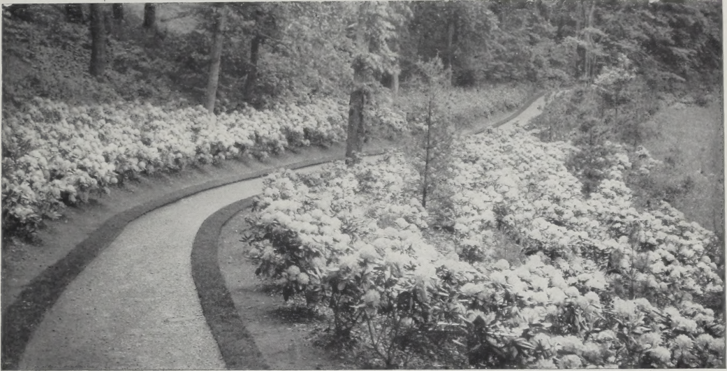
OUR HARDY HYBRID RHODODENDRONS IN BORDERS