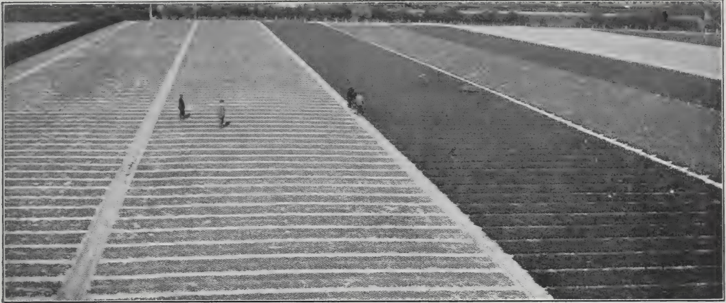
RAISING FORESTRY STOCK FOR COMMERCE

The increasing demand for forestry material has led to commercial enterprise in the furnishing of FORESTRY STOCK , and this Company has spared no effort, and we believe successfully, to become HEADQUARTERS for every variety of both deciduous and evergreen seedlings and transplants . As a result, we are in closest touch with the entire market, both in the United States and abroad, and have, therefore, exceptional facilities for furnishing all sizes and quantities required, and at most favorable prices .