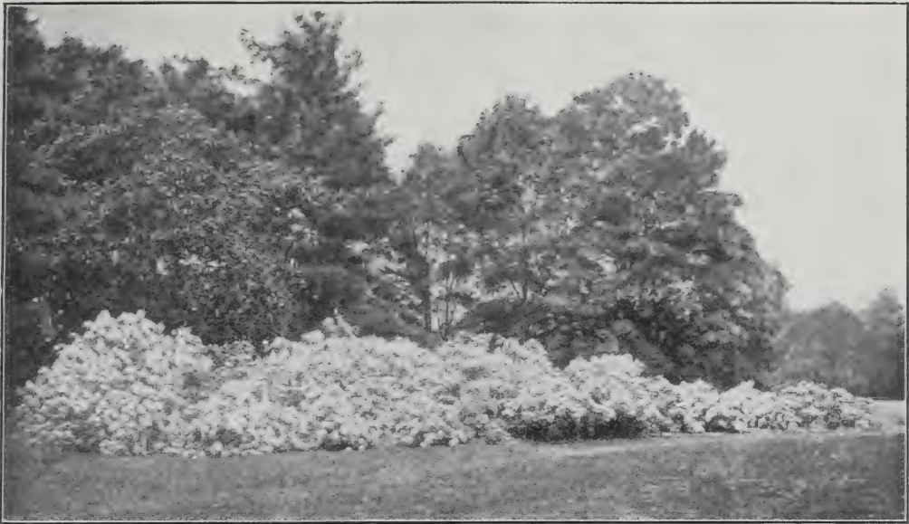
AN EFFECTIVE BORDER OF HARDY RHODODENDRONS IN BLOOM. See page 20.