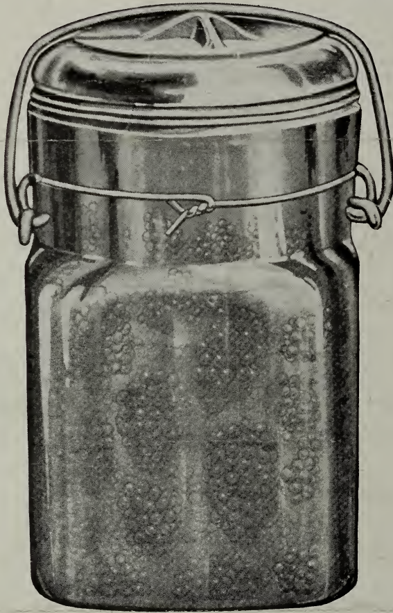
Macatawa is a Great Berry for Canning.