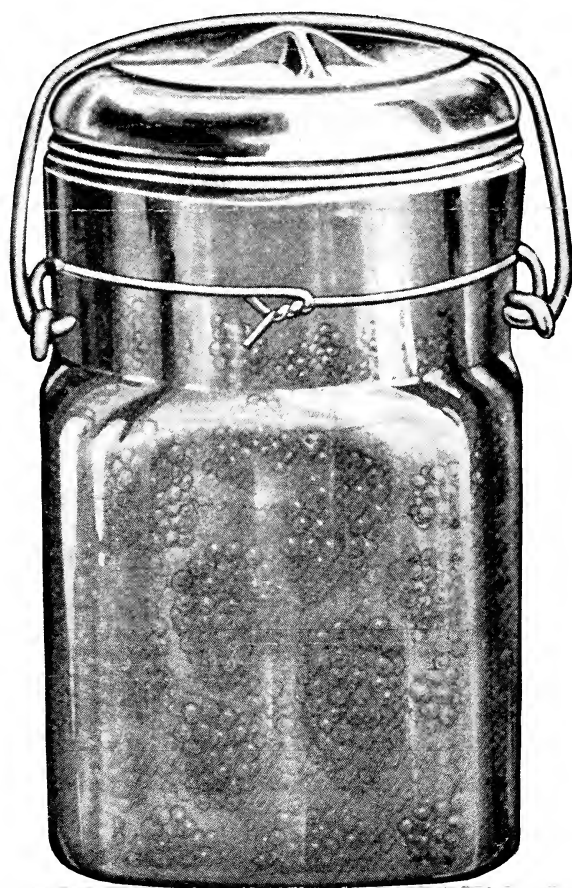
Macatawa is a Great Berry for Canning.