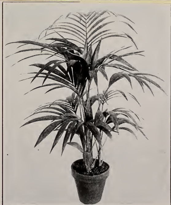
Kentia Belmoreana (Made-up Plants)