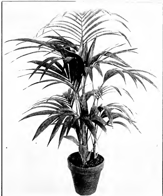
Kentia Belmoreana (Made-up Plants)