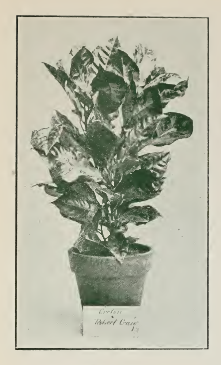
NEW SEEDLING CROTON ROBERT CRAIG