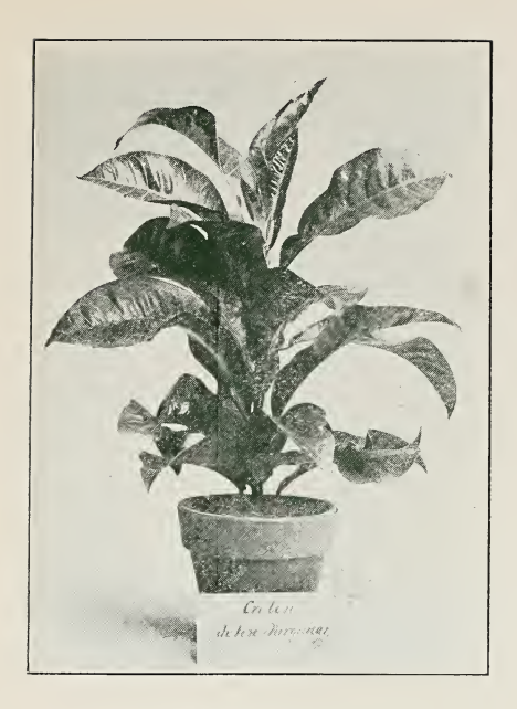
NEW SEEDLING CROTON JOHN FARQUHAR