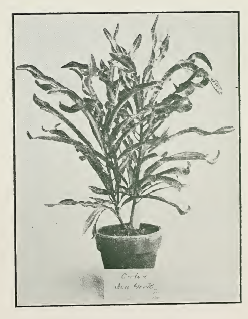
CROTON NEW YORK