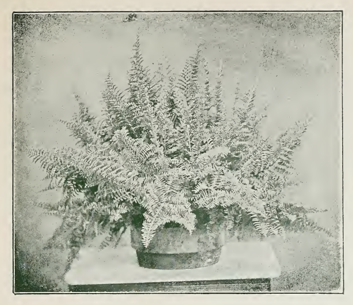
NEPHROLEPIS ELEGANTISSIMA IMPROVED