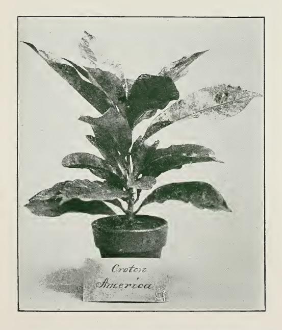
NEW SEEDLING CROTON AMERICA