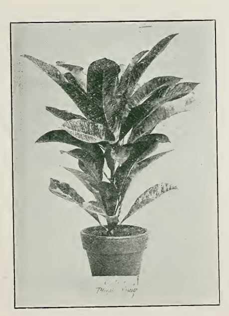
NEW SEEDLING CROTON PHYLLIS CRAIG