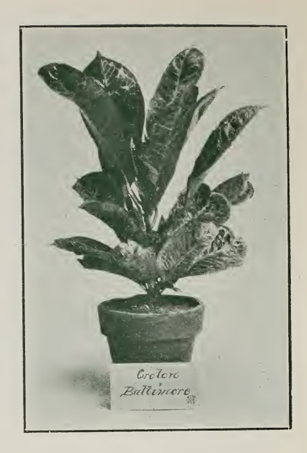
NEW SEEDLING CROTON BALTIMORE