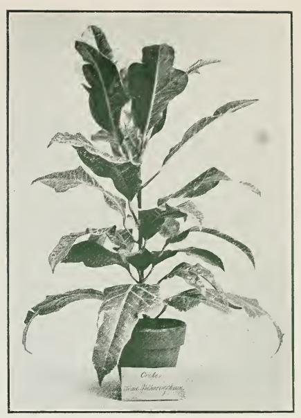
NEW SEEDLING CROTON JEAN FOTHERINGHAM