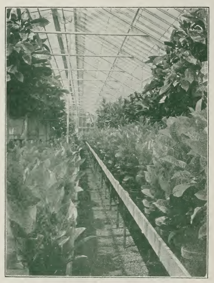
A HOUSE OF CRAIG QUALITY CROTONS