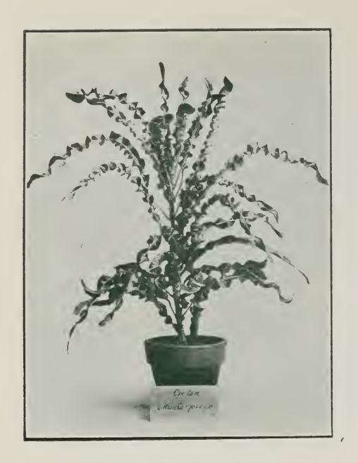
NEW SEEDLING CROTON MASTERPIECE