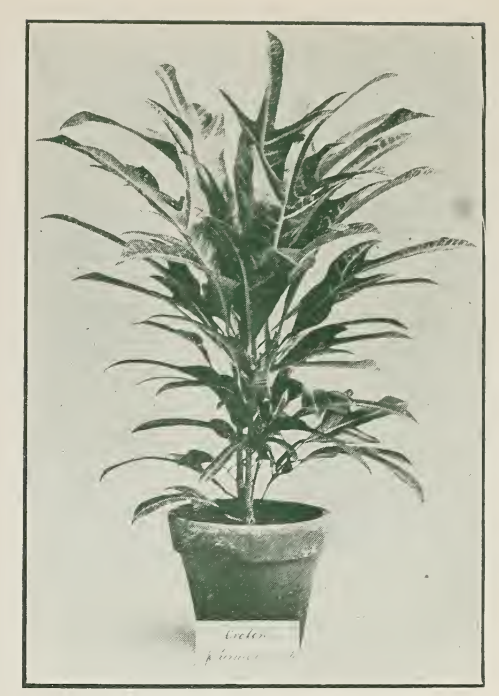
CROTON NORWOOD BEAUTY