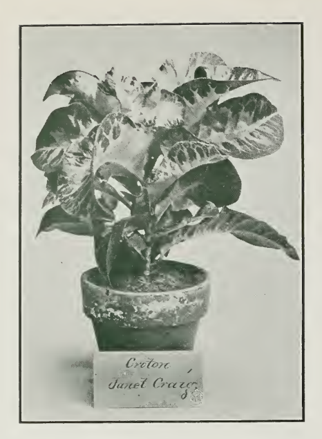
NEW SEEDLING CROTON JANET CRAIG