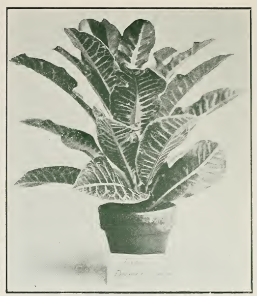
NEW SEEDLING CROTON RODMAN WANAMAKER