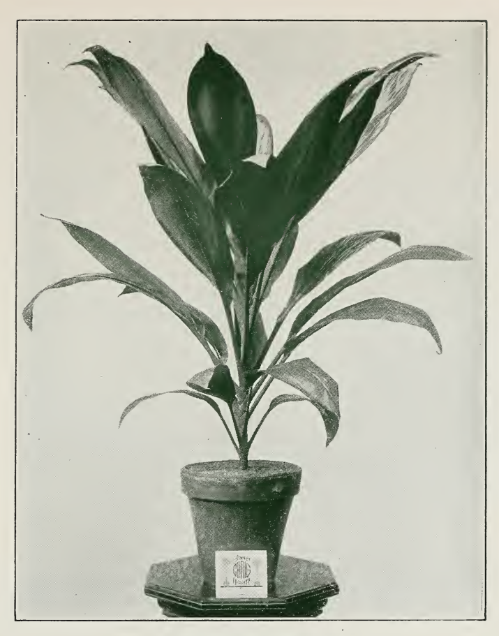
DRACAENA DE SMETIANA