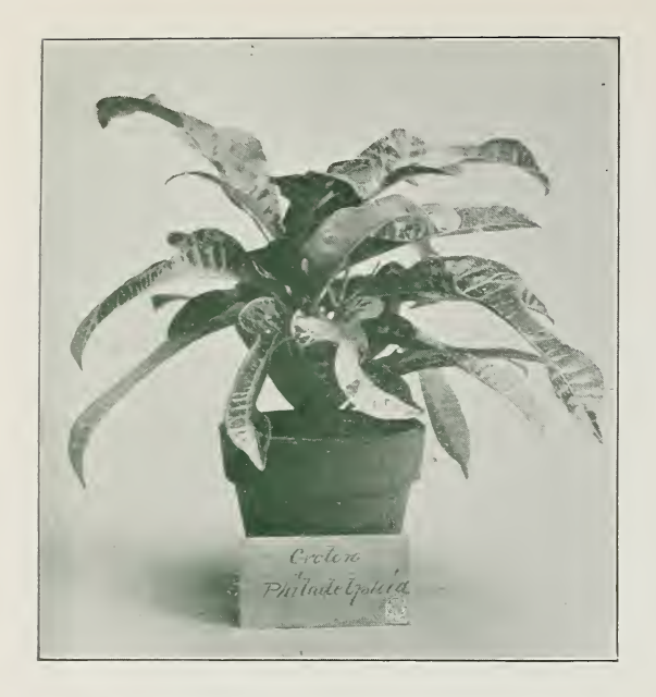
NEW SEEDLING CROTON PHILADELPHIA