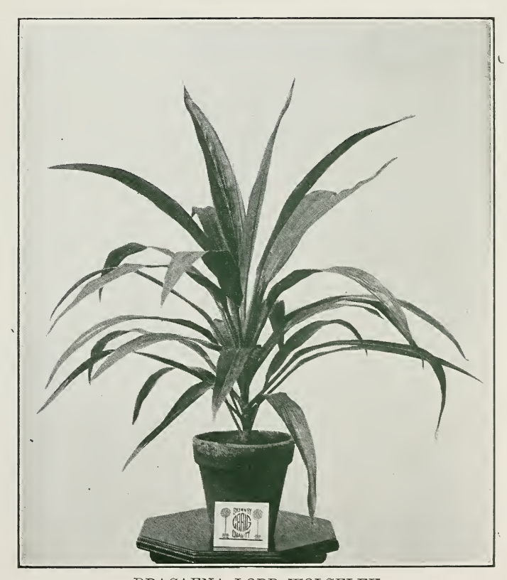
DRACAENA LORD WOLSELEY

7-inch pots, very heavy, $2 and $2.50 each