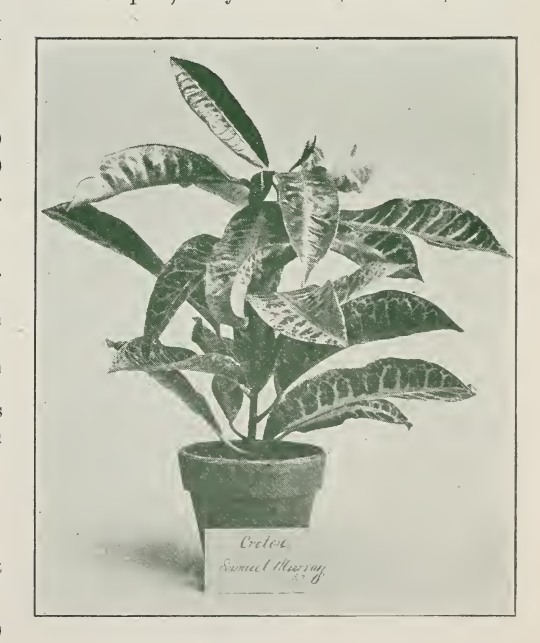
NEW SEEDLING CROTON SAMUEL MURRAY

4-inch pots, heavy ...$6 per doz.; $40 per 100 5-inch pots, heavy ...$9 and $12 per doz. 6-inch pots, heavy ....$18 per doz. 7-inch pots, heavy ....$2.50 and $3 each