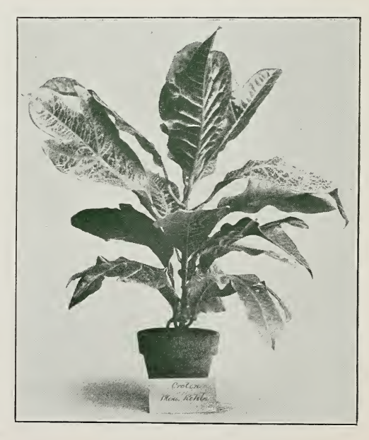
CROTON MONS. KOHL

2¼-inch pots......$5 per 100; $45 per 1,000 4 -inch pots.....$20 per 100; $180 per 1,000 6 -inch pots......$6 per doz.; $45 per 100 6 -inch pots, heavy..$9 per doz.; $70 per 100 8 -inch ¾ pots.....$12 per doz.; $90 per 100 10 -inch ¾ pots......$18 per doz. 11 -inch tubs.......$2, $2.50 and $3 each