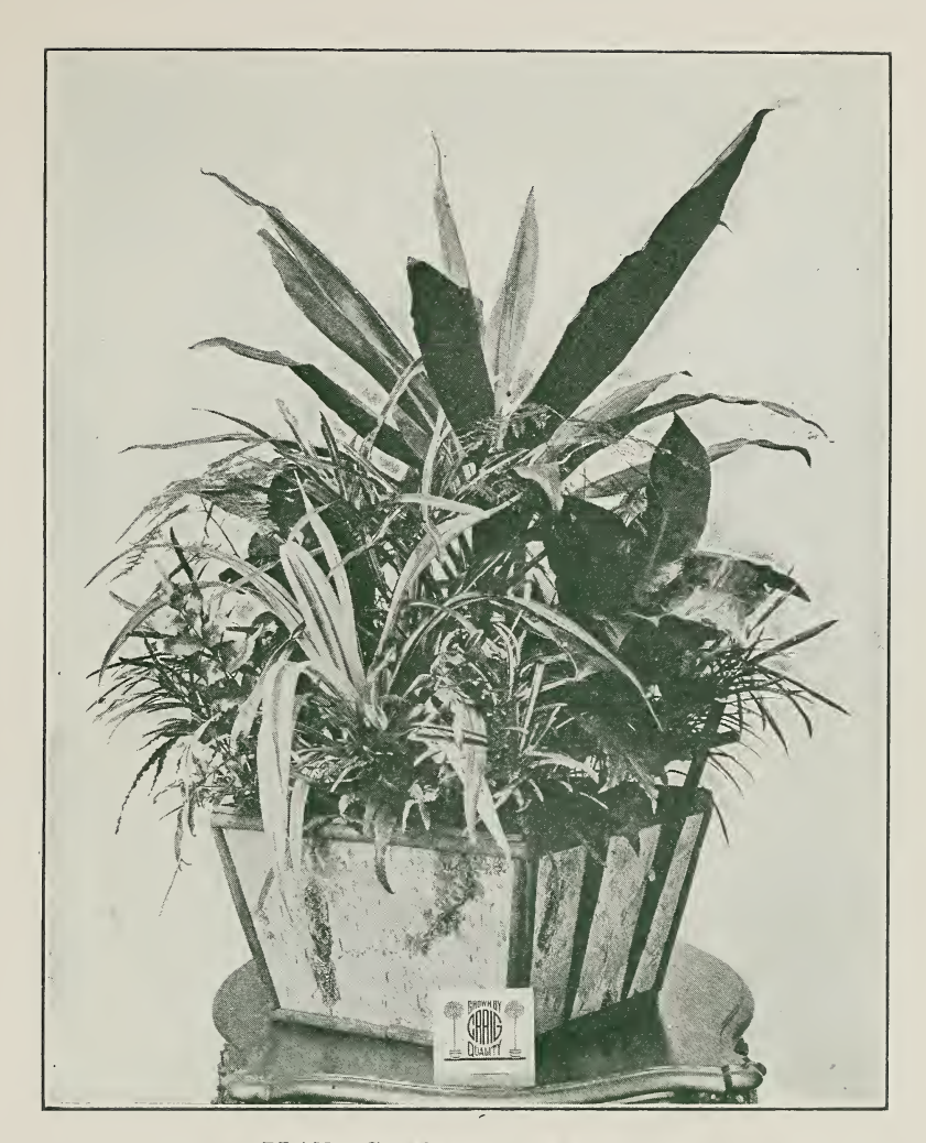
PLANT COMBINATION BASKET