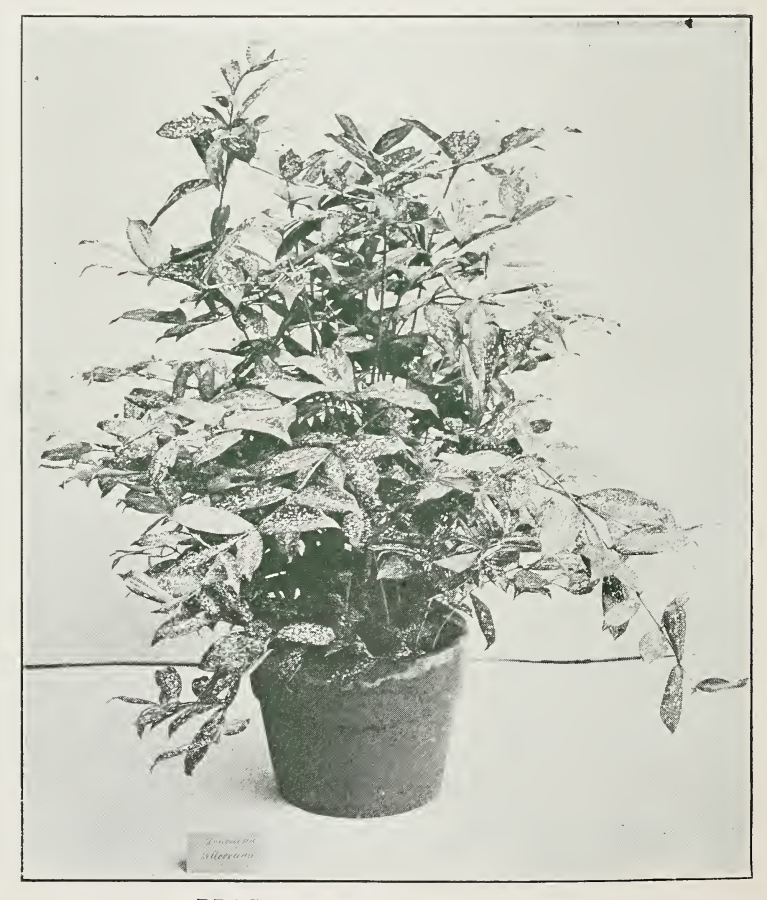
DRACAENA KELLERIANA (NEW)