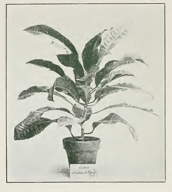
NEW SEEDLING CROTON MRS. ROBT. CRAIG

25 cents per fruit 2\frac{1}{4} inch pots for growing on . . . $8 per 100; $75 per 1,000