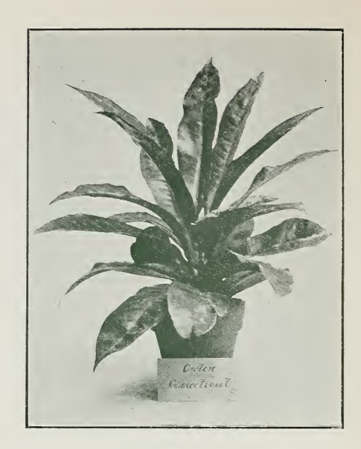
NEW SEEDLING CROTON CONNECTICUT