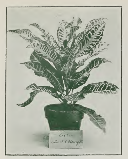
NEW SEEDLING CROTON MRS. A. A. ALBRIGHT

The cut on this page will give some slight idea of the new special Croton combination that we have prepared for this Fall trade; in a white cedar box, 12 inches square, 6 inches deep, covered with birch bark, and trimmed in brown. The ivy shown is the small leaf variety. The crotons are of very high color, artistically arranged and are well established. We are sure these will prove to be excellent sellers. $5, $6, $7.50 and $10 each.