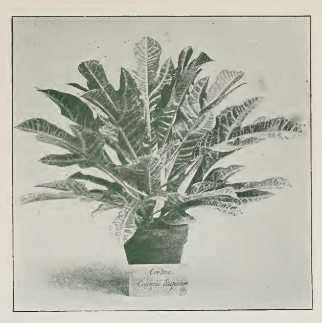
NEW SEEDLING CROTON CRAIGII SUPREME