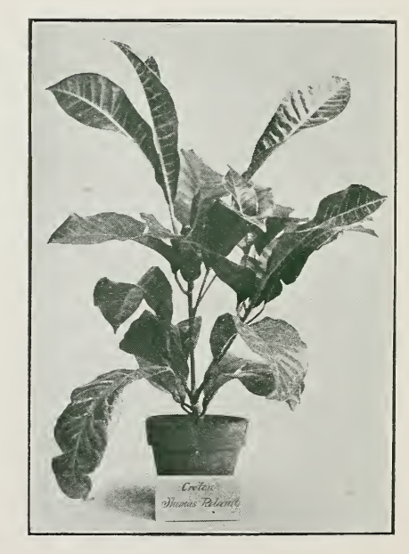
NEW SEEDLING CROTON THOMAS ROLAND