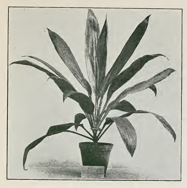
DRACAENA IMPERIALIS (RARE)