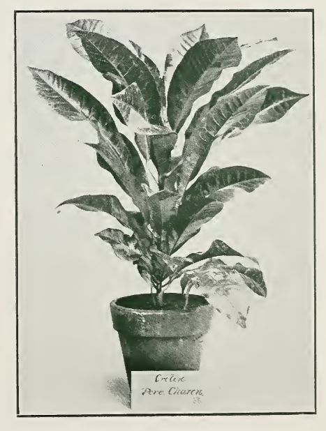
CROTON PERE CHARON