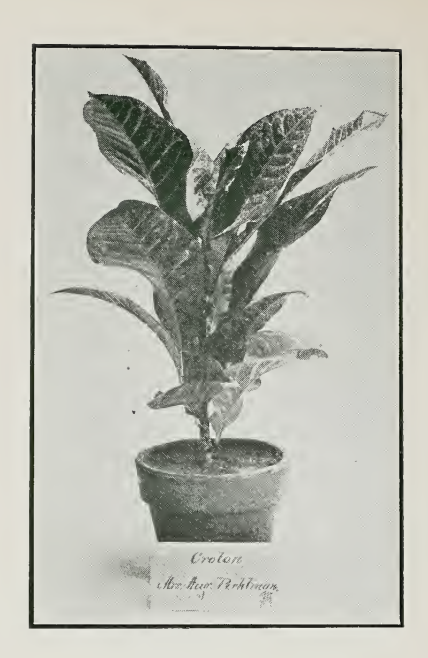
NEW SEEDLING CROTON AUGUST POEHLMANN

The plant of the century. Positively the best house and porch plant to date. Our stock of this wonderful plant this year is finer than we have heretofore offered. It will surely give satisfaction.