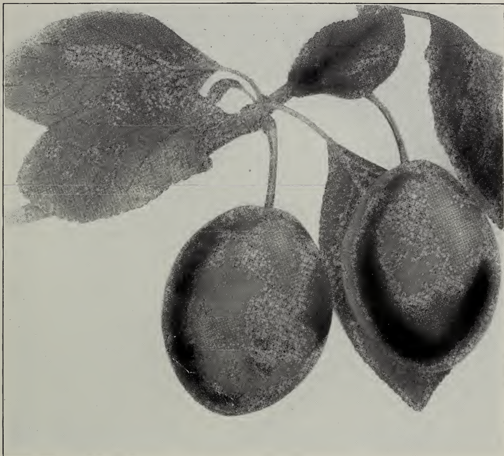
ITALIAN PRUNE OR FELLENBURG