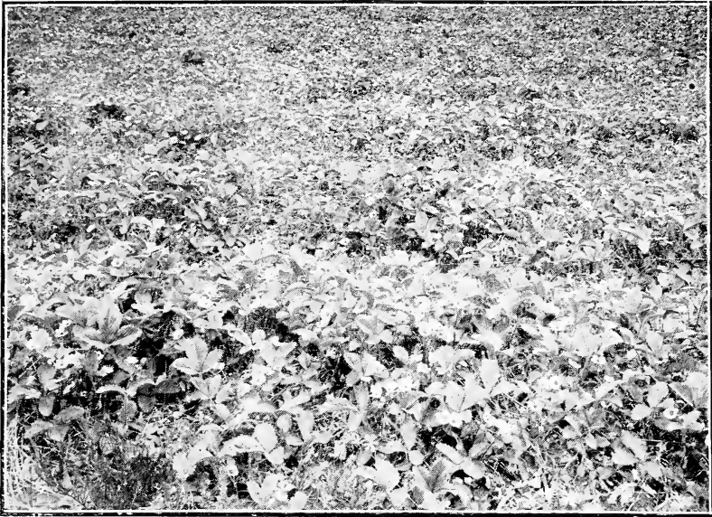
A Strawberry Field.