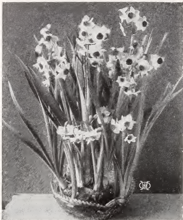
Chinese Sacred Lily