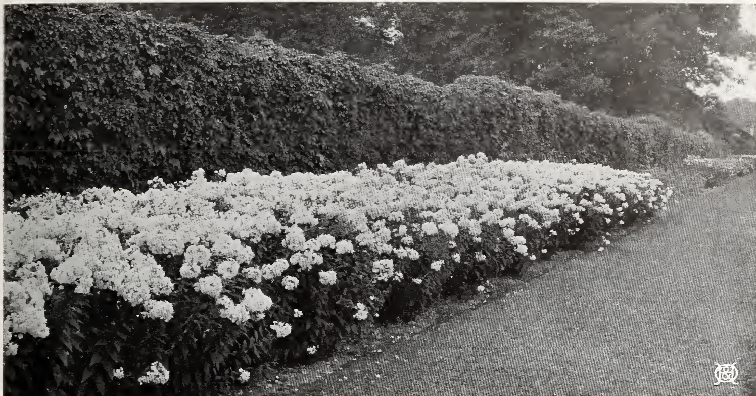
The great trusses of the Phlox bend and sway in summer's breezes