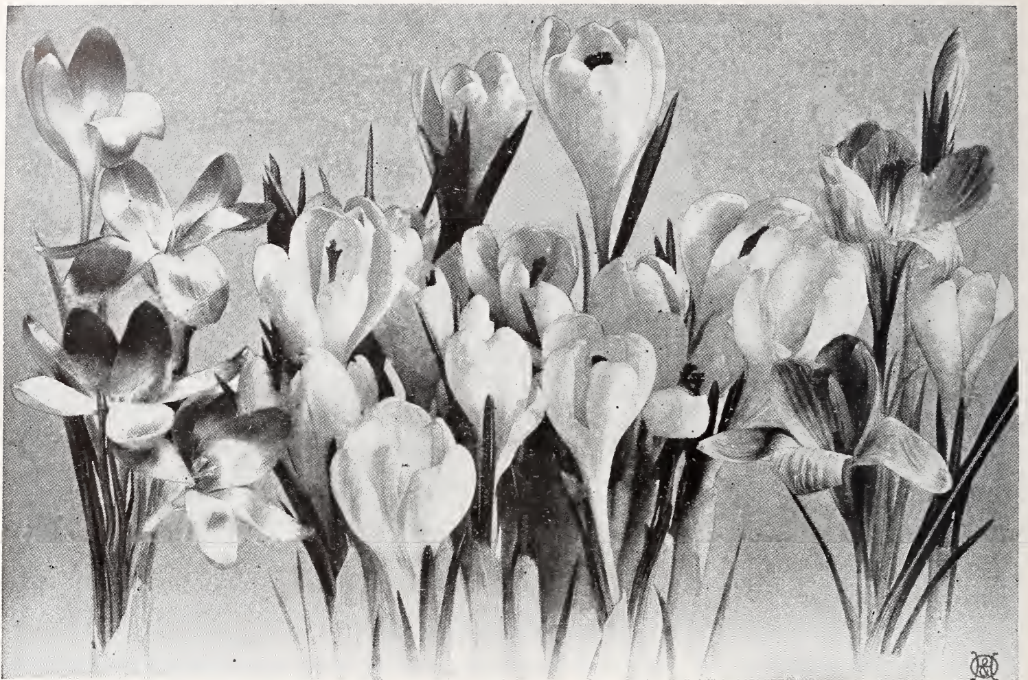
Purpurea grandiflora Crocus