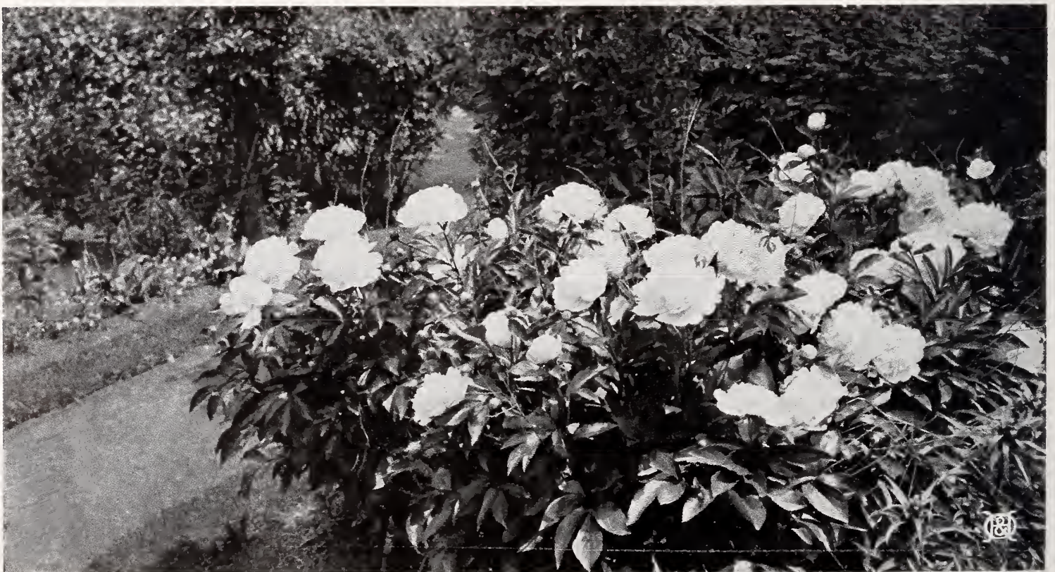
The Peony rivals the rose in color, and continues in bloom for a month or more