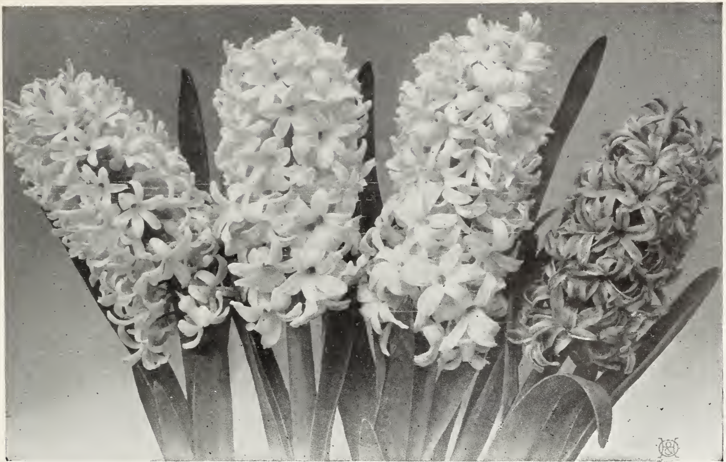
Baron Van Thuyll Grande Blanche La Grandesse Lady Derby