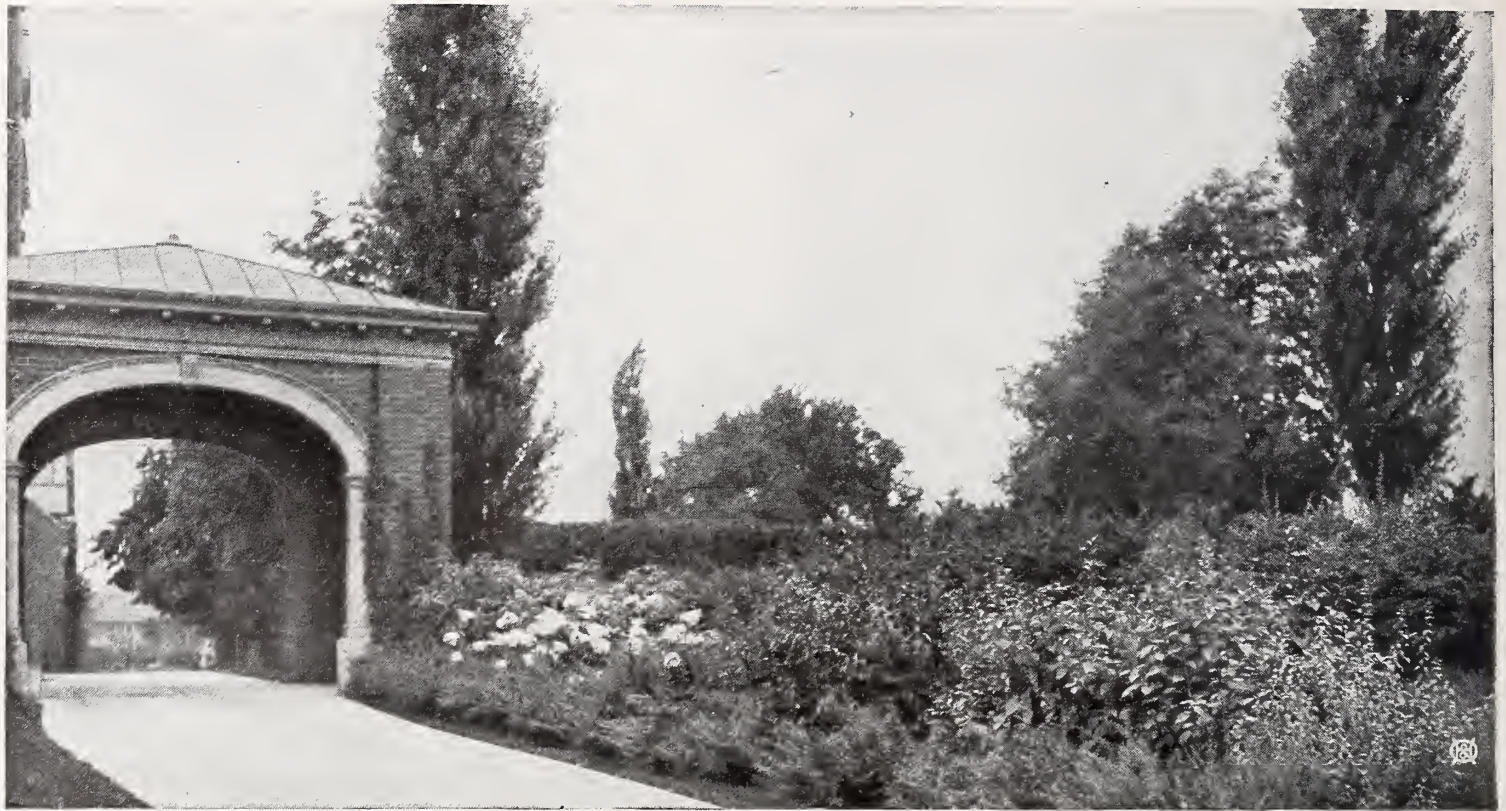
An approach made attractive by a good selection of Hydrangeas, Barberries, Elders and other shrubs