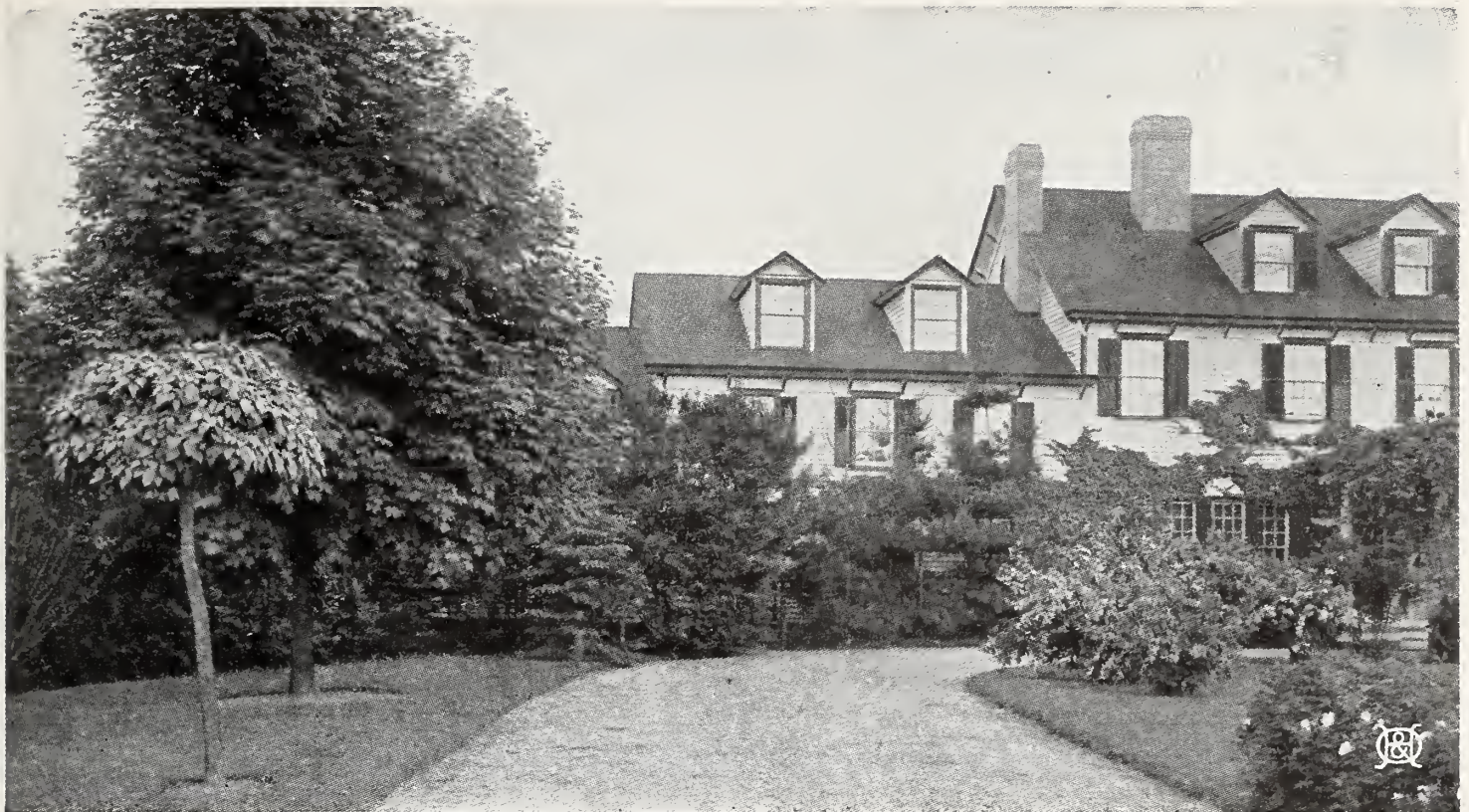
An artistic planting of Maples, Evergreens, Shrubs and Vines