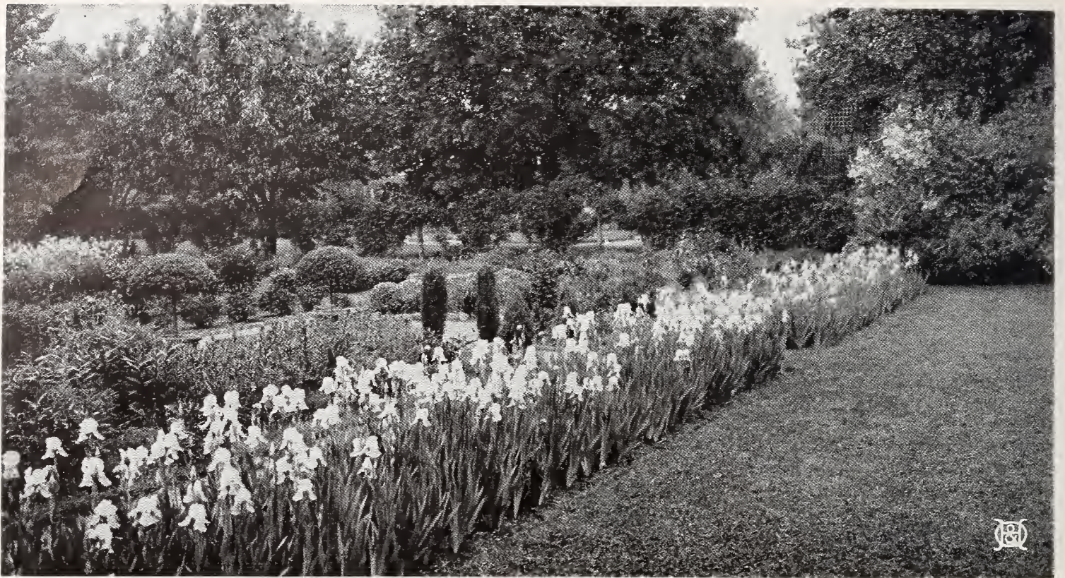
The garden Iris rivals the orchid in dainty coloring and markings