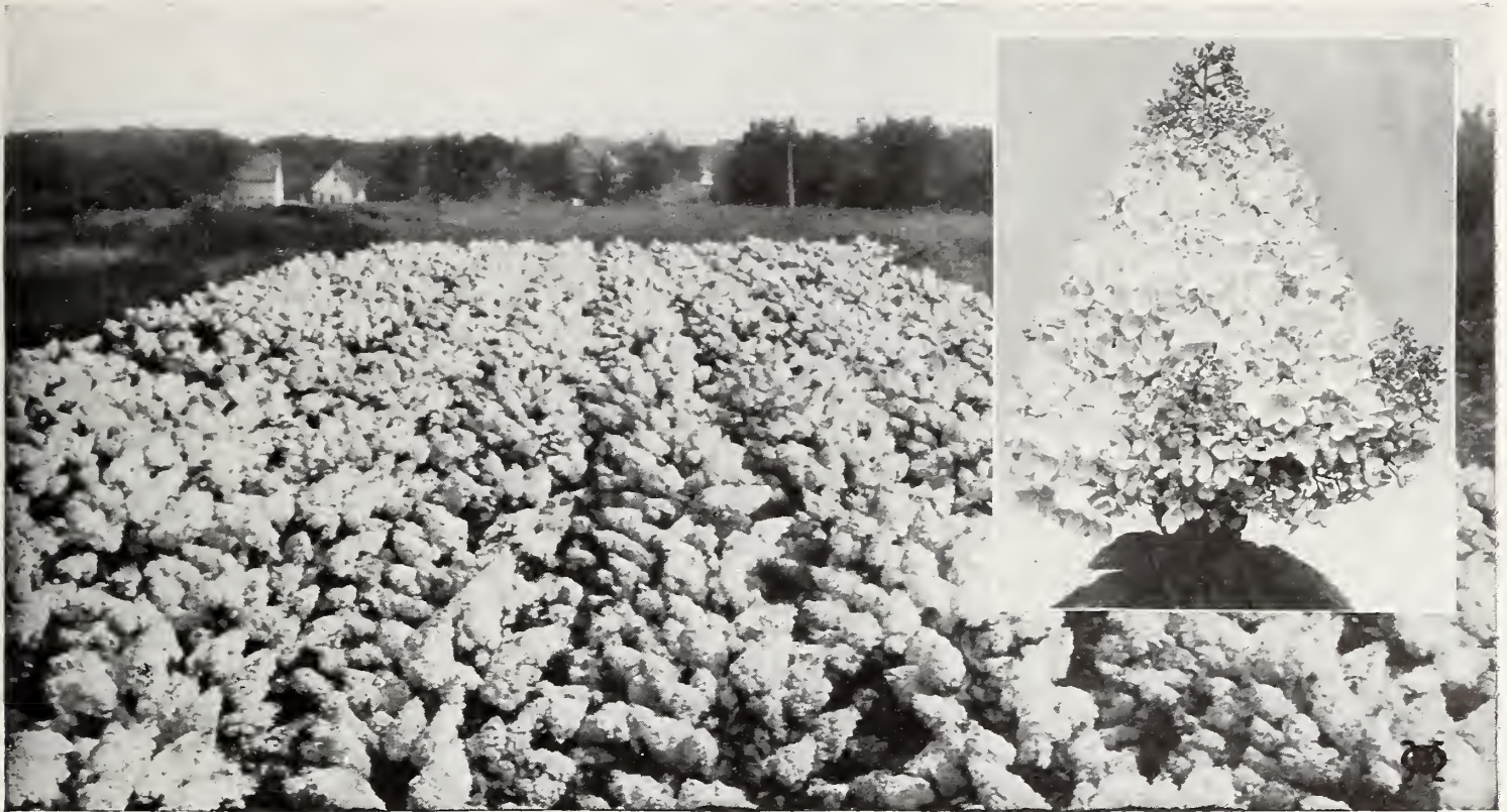
One rarely finds a block of Hydrangeas in full bloom. This picture was made at the Park Nurseries in 1912