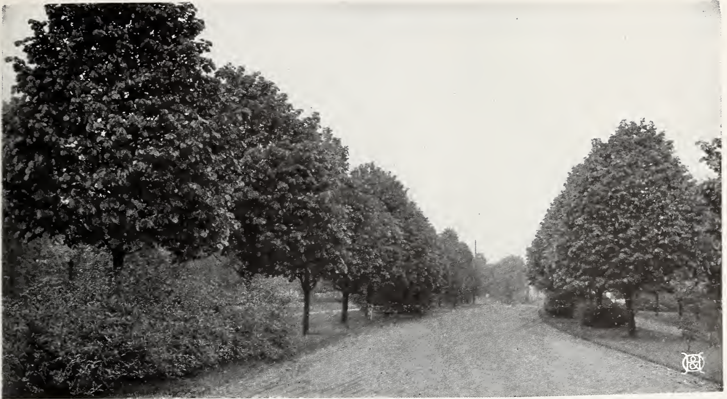
A street planting of young American Linden trees