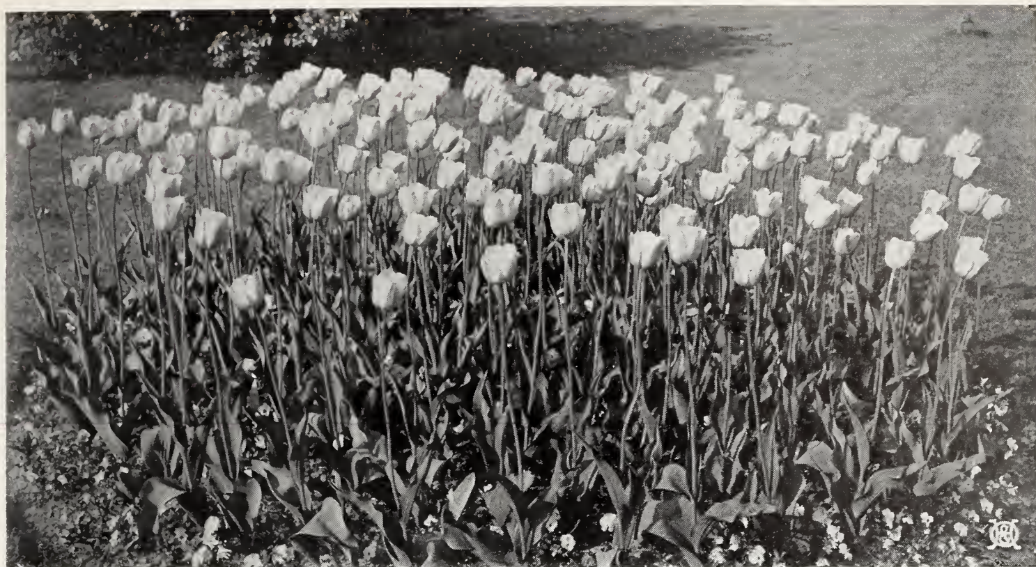
Darwin Tulips, Madame Krelage