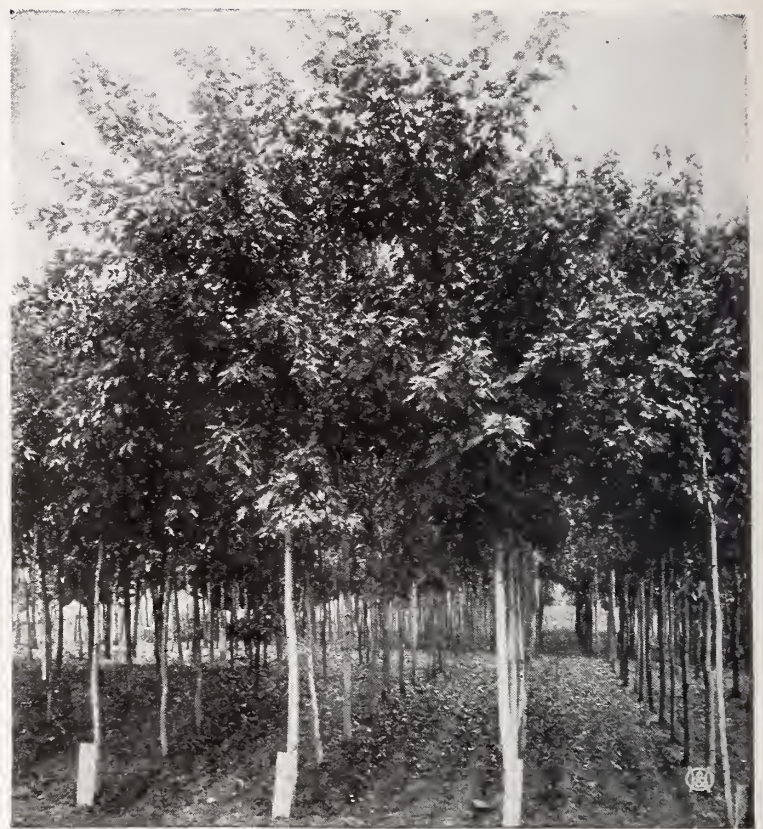
A block of Norway Poplars and companion Silver Maples, at the Park Nurseries