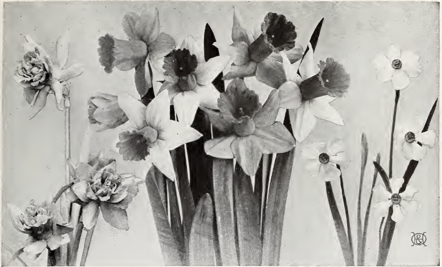
Double Von Sion