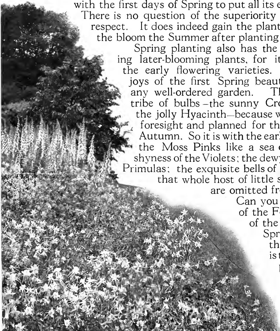
An effective planting of Aquilegia and Foxglove

Can you forego the golden bells of the Forsythias, the blossoms of the Dogwood, and the other Spring-flowering Shrubs this coming season? Now is the time to get busy and plan for their reception. Before the nippy days of Jack Frost come around in earnest your future garden should be well on its way toward being planted out.