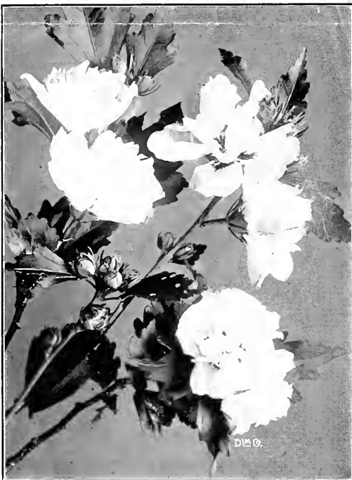
Althaea, Hibiscus or Rose of Sharon