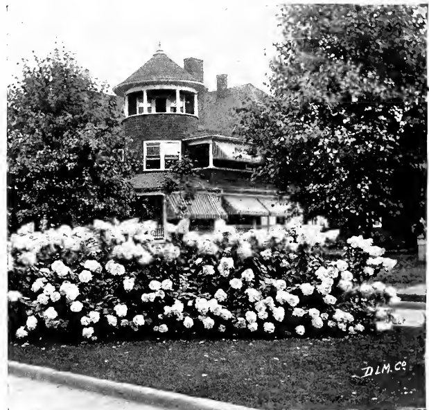
Planting of Hydrangea Paniculata

These prices include boxing and packing, but not transportation charges. No less number than six of one variety sold at dozen rates or twenty-five at hundred rates. No restrictions as to number of collections ordered.