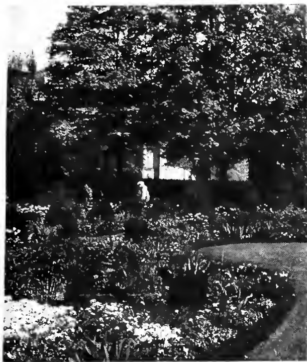
A delightful Perennial garden bordered with Boxwood

The illustrations on this page are intended to show what charming permanent effects can be produced by Fall planting of Palisades Hardy Perennials and Shrubs.