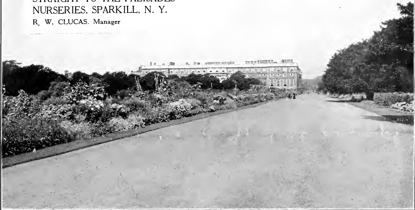
A Highway of Perennials leading to Hampton Court Palace, London. By planting this Fall, a similar effect can be produced by next Summer