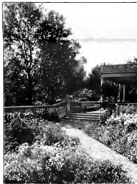
This picture shows a bright array of Perennials to be enjoyed from the veranda