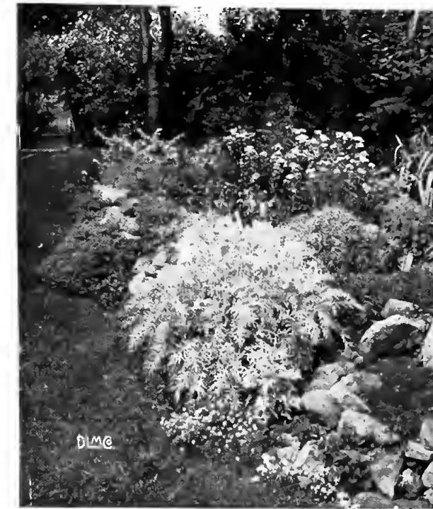
A fine Rockery in a cool and shady spot