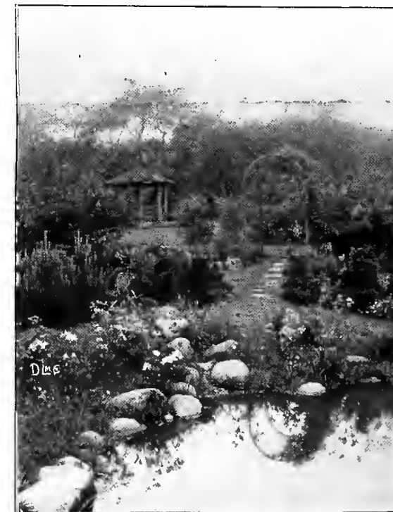
Many varieties of Perennials are suitable for planting on pool margins, making a very attractive showing