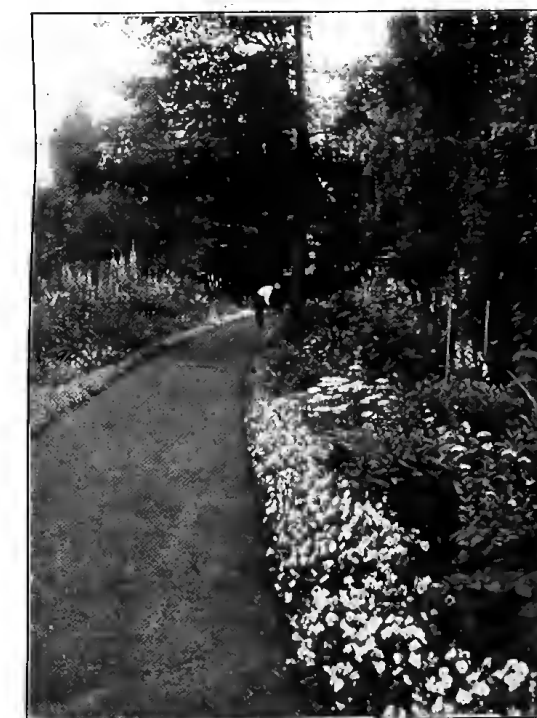
The garden path always looks well bordered with Perennial plants