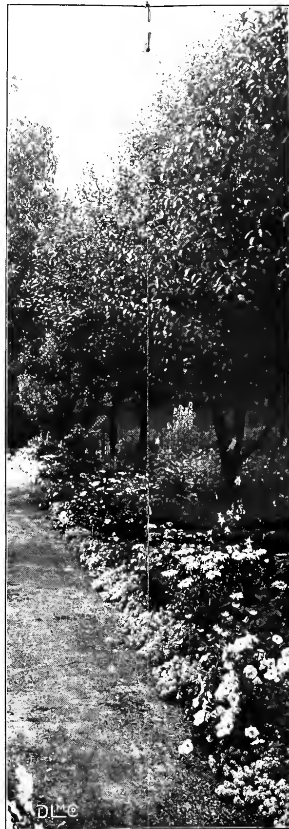
Border of Perennials with background of Trees