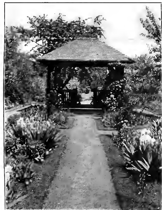
A charming approach to "My Ladies' Garden"