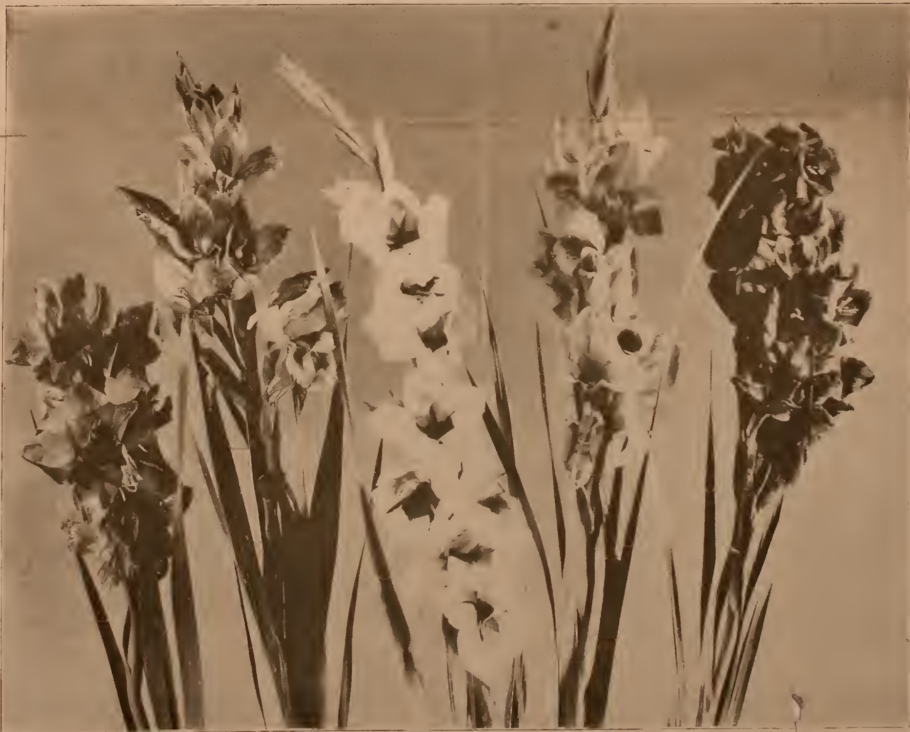
FROM SOME OF OUR COLLECTIONS.

W e are the largest Growers of Gladioli in the Northwest. Our stock comprises all of the leading varieties and many new and distinct species of rare merit, introduced by us. There is not a variety of Gladioli known to the world of growers, but what we can supply on short notice, except, perhaps, in very rare instances. We market bulbs that are fully matured, vigorous and free from disease and that have passed the most crucial test for quick and marvelous production. We give our personal care to the growing and digging and special attention to the grading of all bulbs, and we cannot accept any responsibility for errors that may occur, other than now and then to replace stock that may prove untrue, by some oversight or mistake.