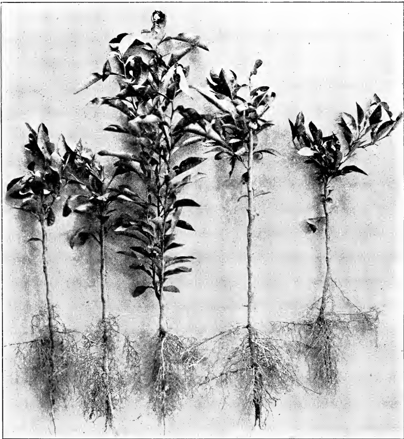
Two year old Florida Sour Stock.

Until recent years, practically all seedlings raised in California were sweet stock, and a large percentage of all the orchards in the state have this root.