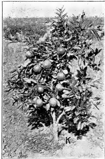
Three-year old Washington Navel

We have this season, a fine lot of citrus trees, both seed-bed and budded stock. We grow trees true to name and equal to the best.