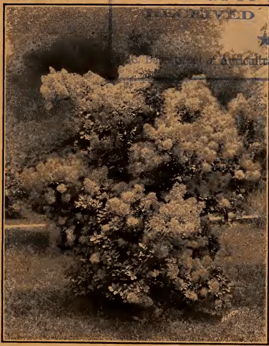
Rhus Cotinus. Purple-fringed Sumach