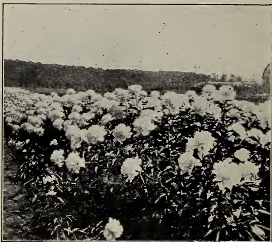
Field of Peonies