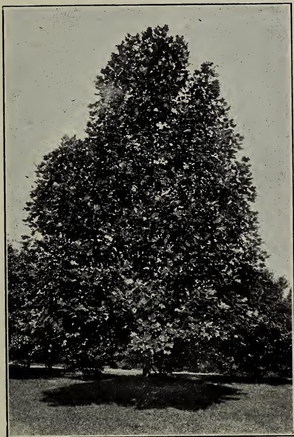
Liriodendron tulipifera (Tulip Tree)