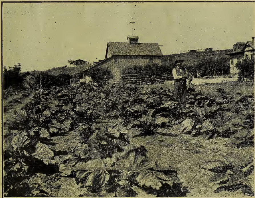
Rhubarb Demonstration Plant, Long Beach, Calif.

Where our justly famous Banwine Rhubarb is grown to test out new varieties and instruct growers in proper culture.