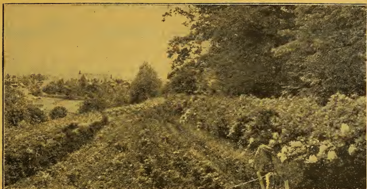
Rhododendrons at Andorra.