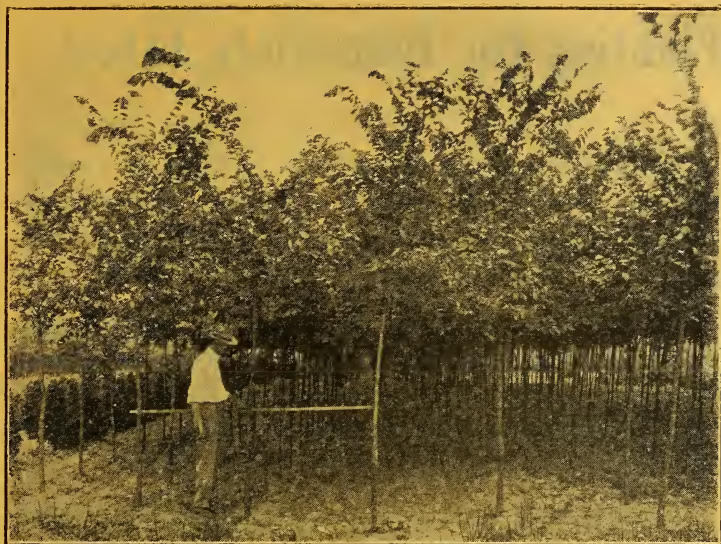
A Block of American White Elm at Andorra.