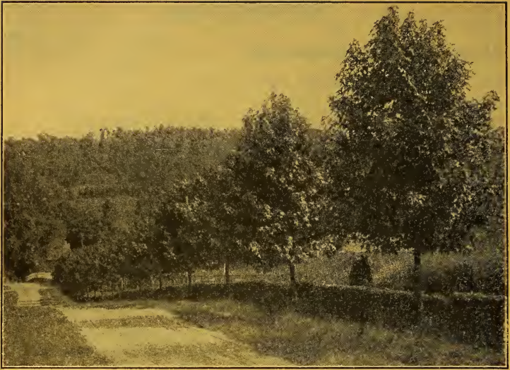
An Avenue of Sweet Gums (Liquidambar), at Andorra.