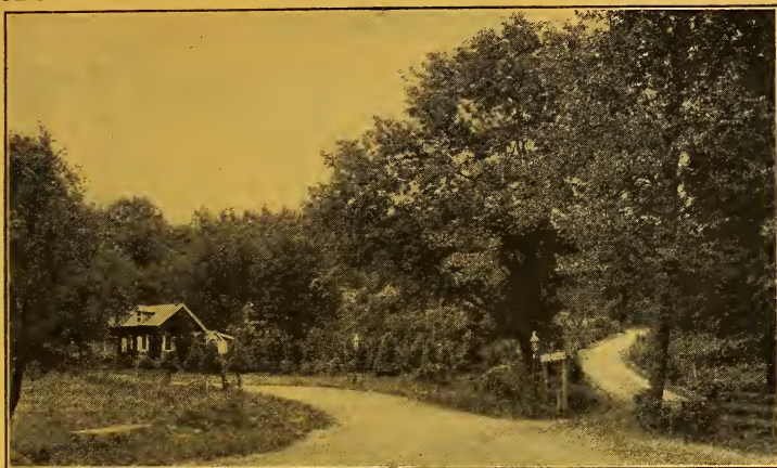
Nursery Entrance and Office.