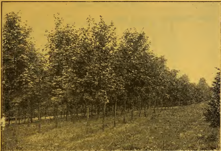
Specimen Norway Maples in Wide Rows.