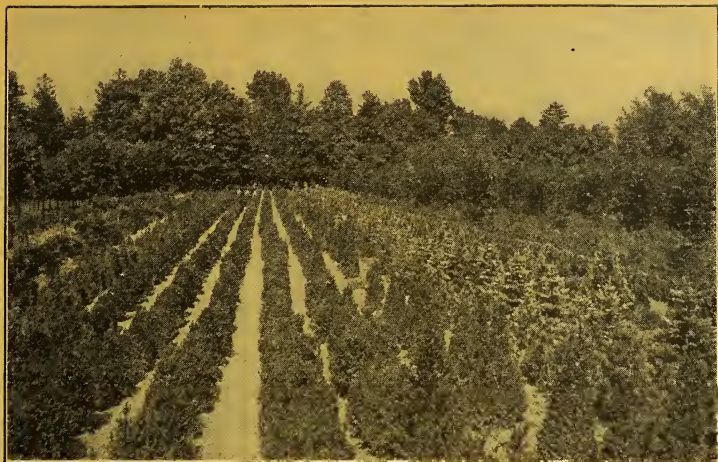
A Block of Box Bush and Evergreens.