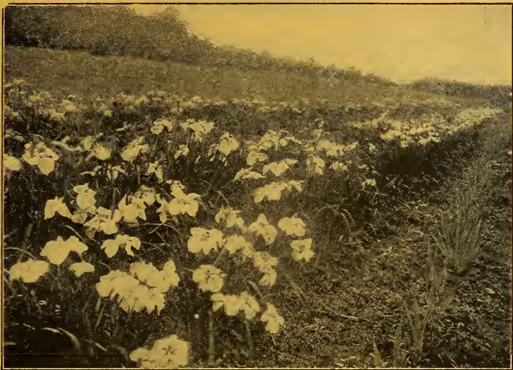
A field of Japanese Iris at Andorra