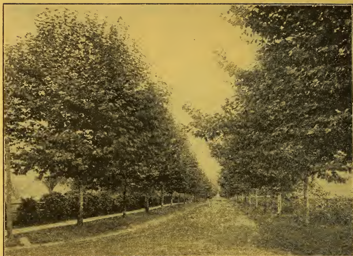
An Avenue of "Andorra-grown" Oriental Planes.