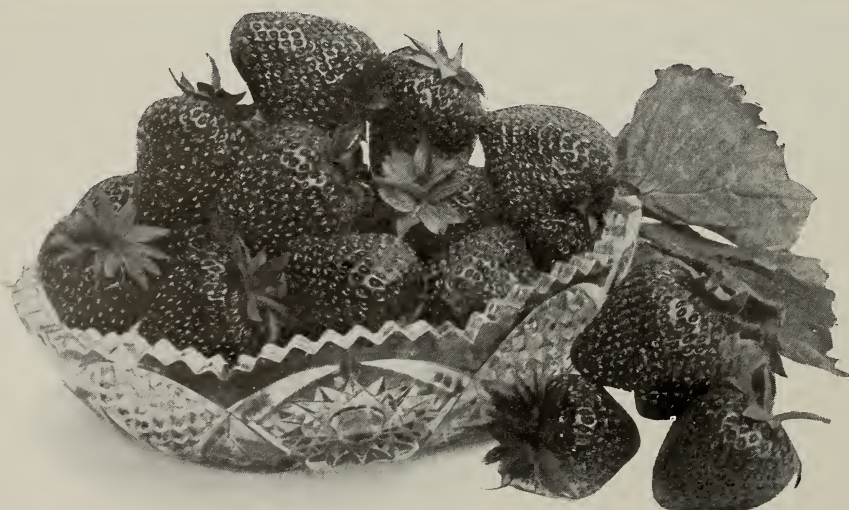
Red Ripe Everbearing Strawberries make a tempting dish when the chill November winds are blowing outside

Harvest the Big Dollars in the Fall From This Wonderful Variety