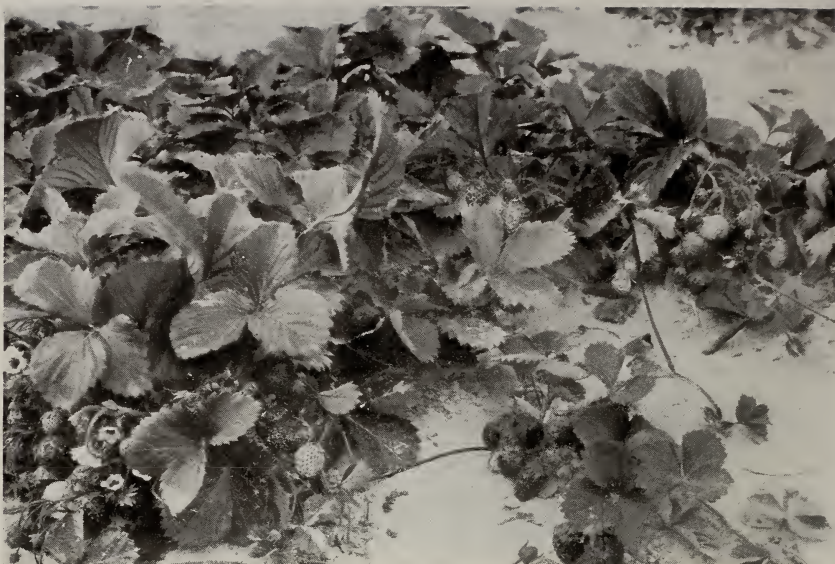
Everbearing Strawberries have blossoms, green fruit and ripe fruit on until a killing frost comes.

As a commercial berry it has no equal, as it produces at a time when berries are at a premium, as