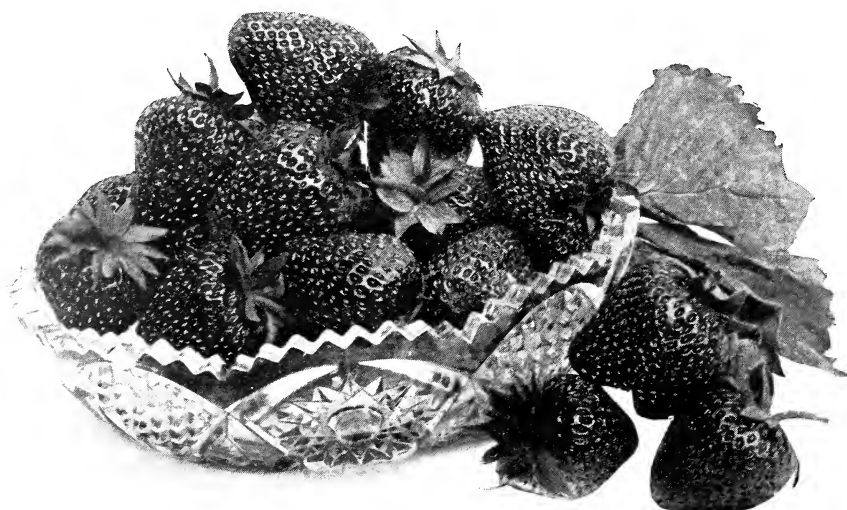
Red Ripe Everbearing Strawberries make a tempting dish when the chill November winds are blowing outside