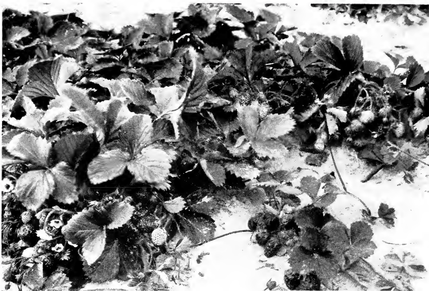
Everbearing Strawberries have blossoms, green fruit and ripe fruit on until a killing frost comes.

As a commercial berry it has no equal, as it produces at a time when berries are at a premium, as