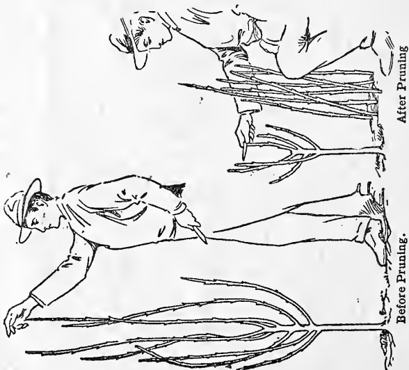
The Proper way to Prune Two Year Old Fruit Trees

To protect trees from worms or borers, early each spring have the earth raised around the tree twelve or fifteen inches high, and remove same in fall. Trees should be mulched early every fall.